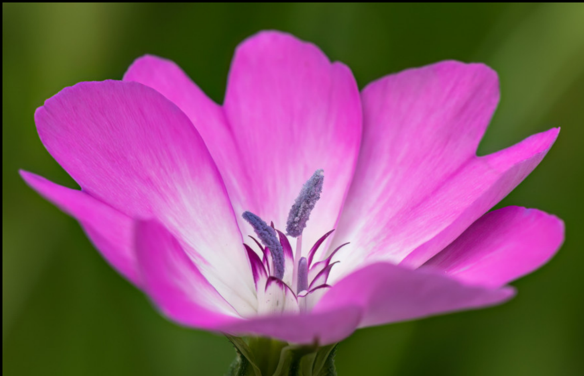
TPS November 2025 Open - 13/15 Simply beautiful by Pieter Swart