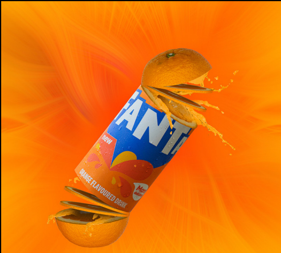
TPS November 2025 Set Subject - 13/15 Fanta orange by Bennie Vivier