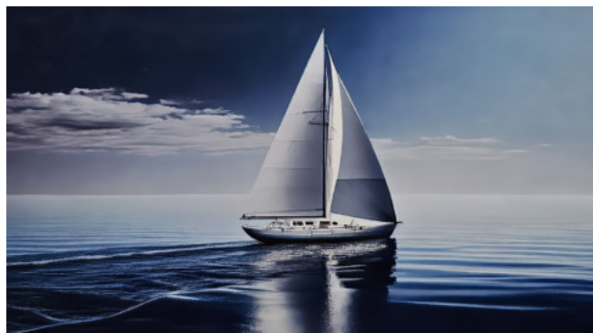
Sea-Fari Cruise voucher