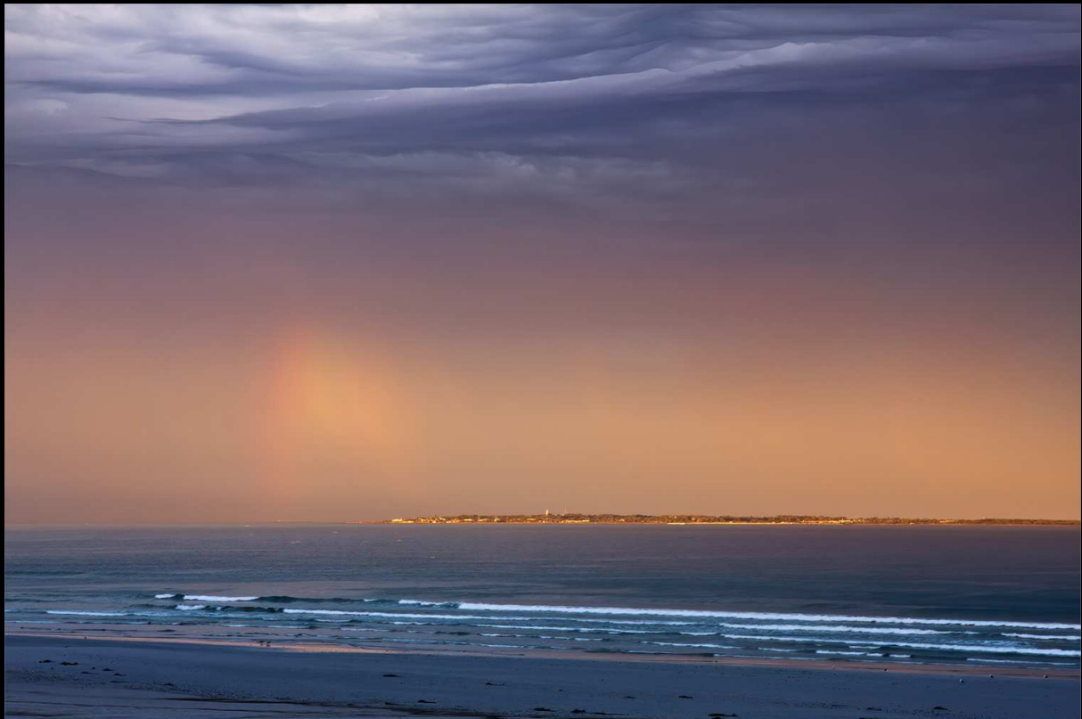
September 2025 Open Competition COM Robben Island in the spotlight by Rob Minter