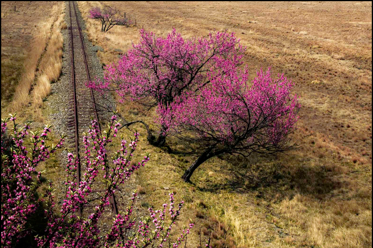
September 2025 Open Competition COM Spring is on its way by Charlotte van der Berg