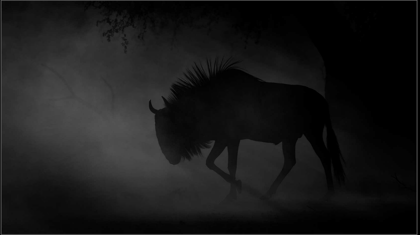
Sun and dust

Pangolin Photo Safari 2021 Competition Runner up