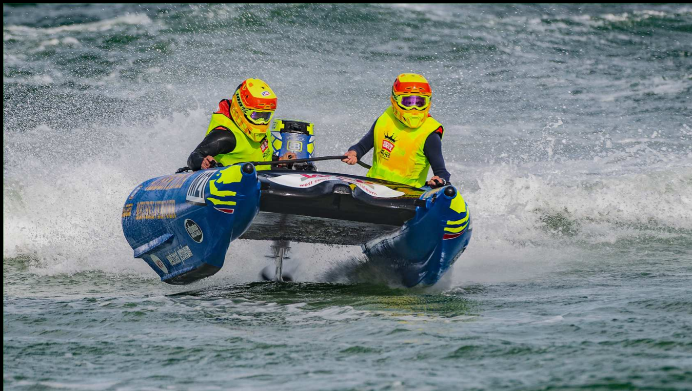
September 2025 Open Competition COM Rubberduck racers by Desmond Labuschagne