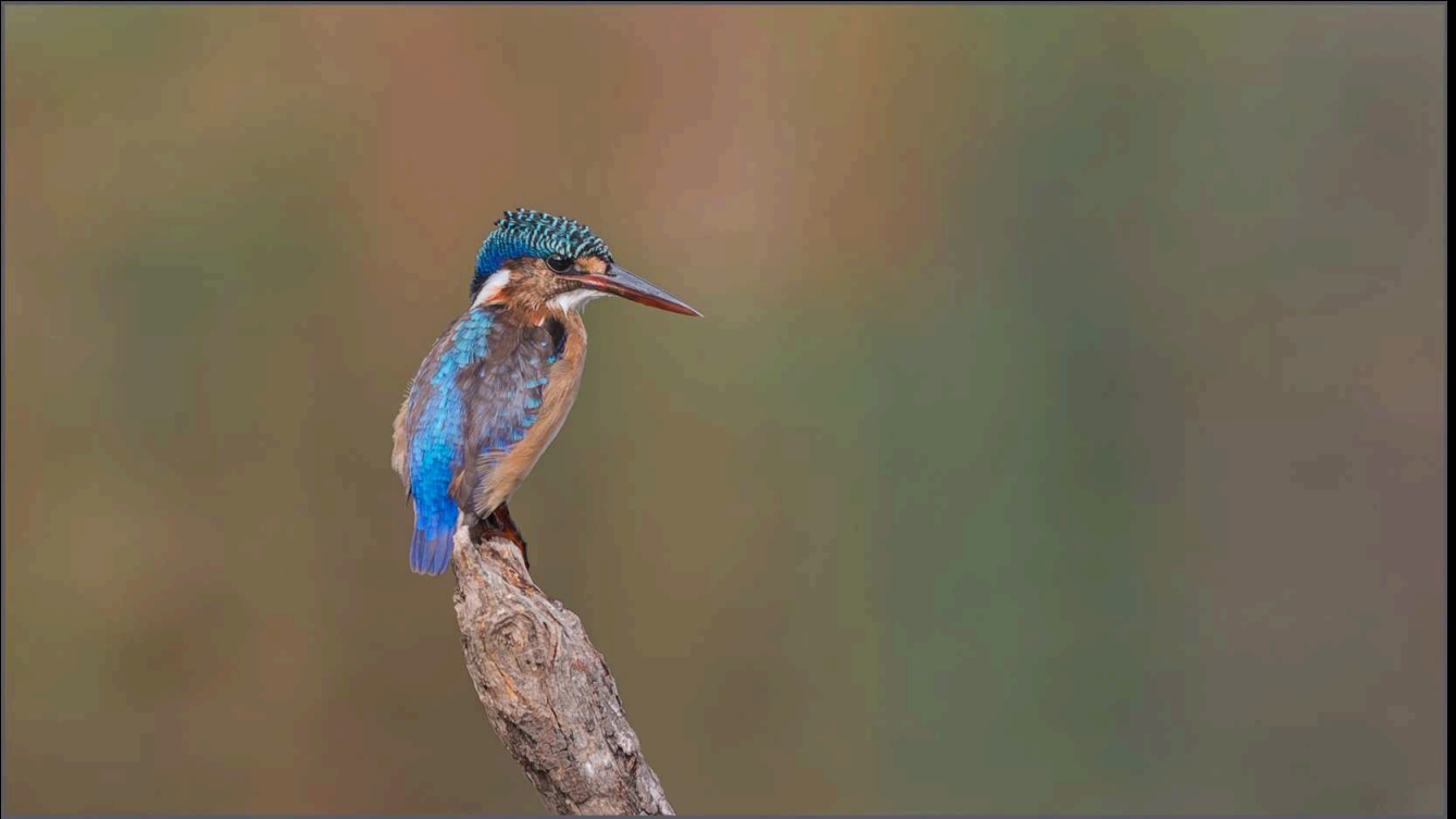
September 2025 Open Competition COM Patiently waiting by Brian Moffatt