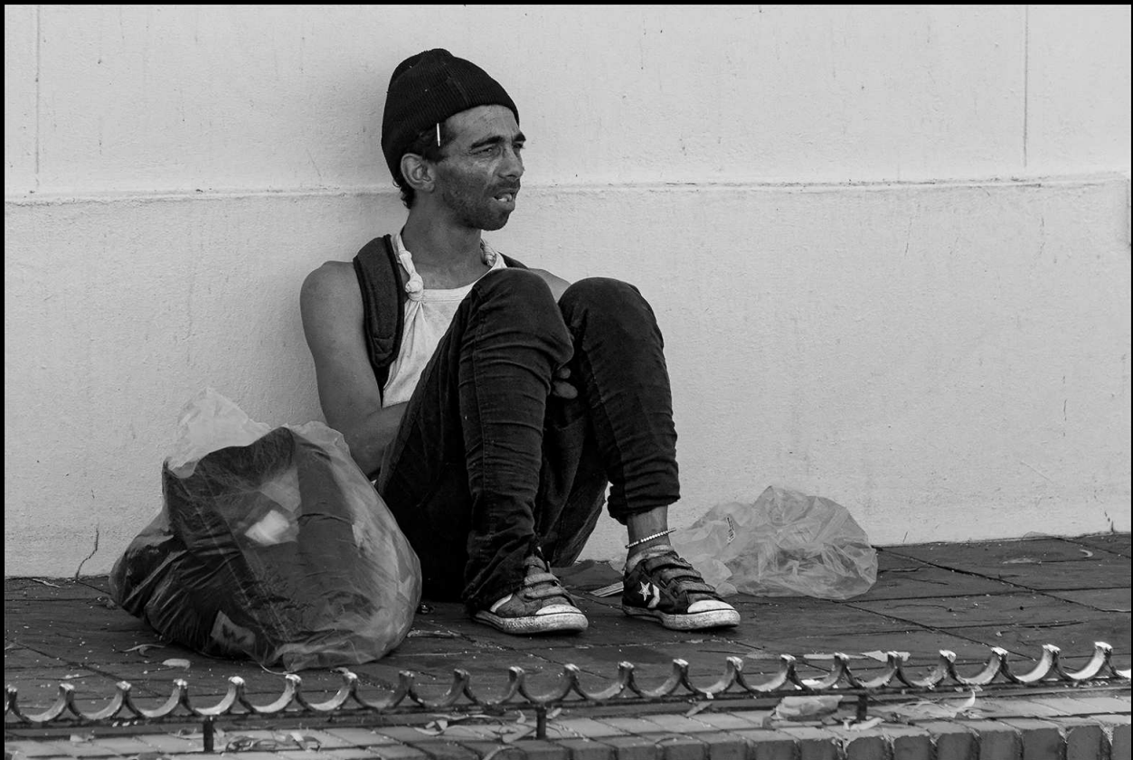
September 2025 Set Subject Competition COM Street life by Desmond Labuschagne