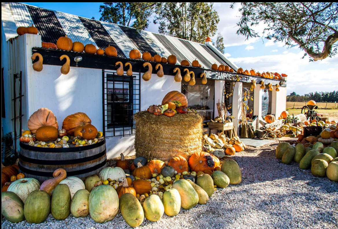
September 2025 Open Competition COM Pumpkin stall by Marleen la Grange