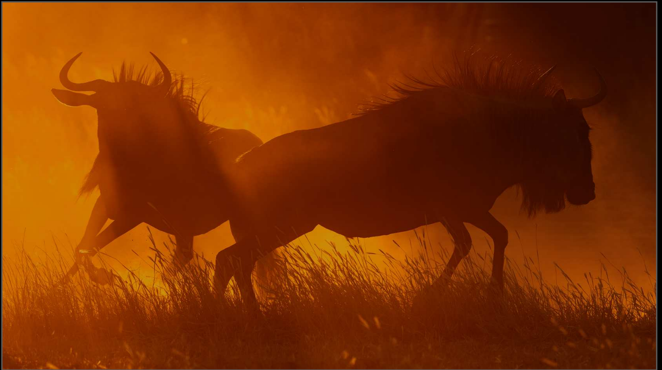
Playing in the dust