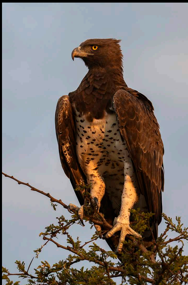
Martial eagle