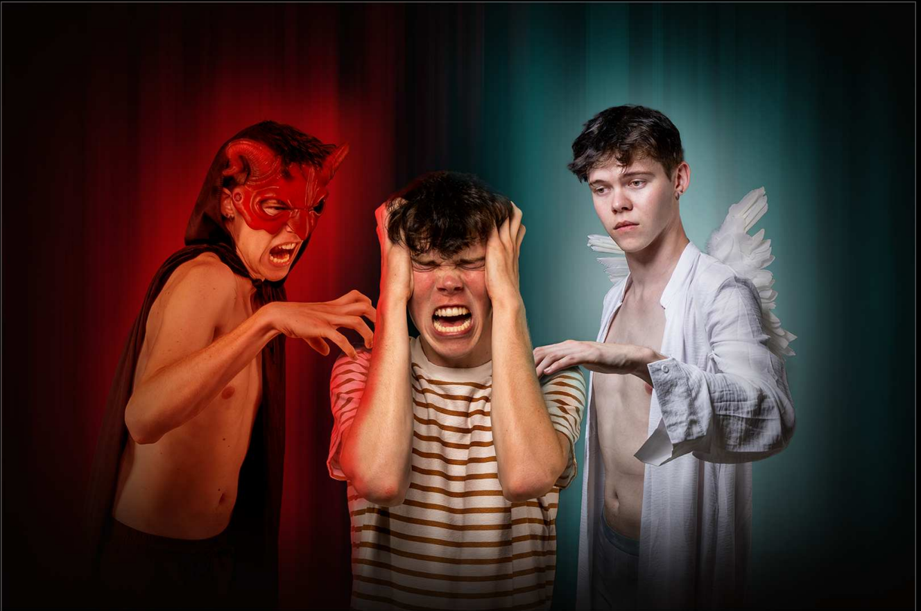
8th Edenvale Digital Salon - COM Traumatic by David Barnes