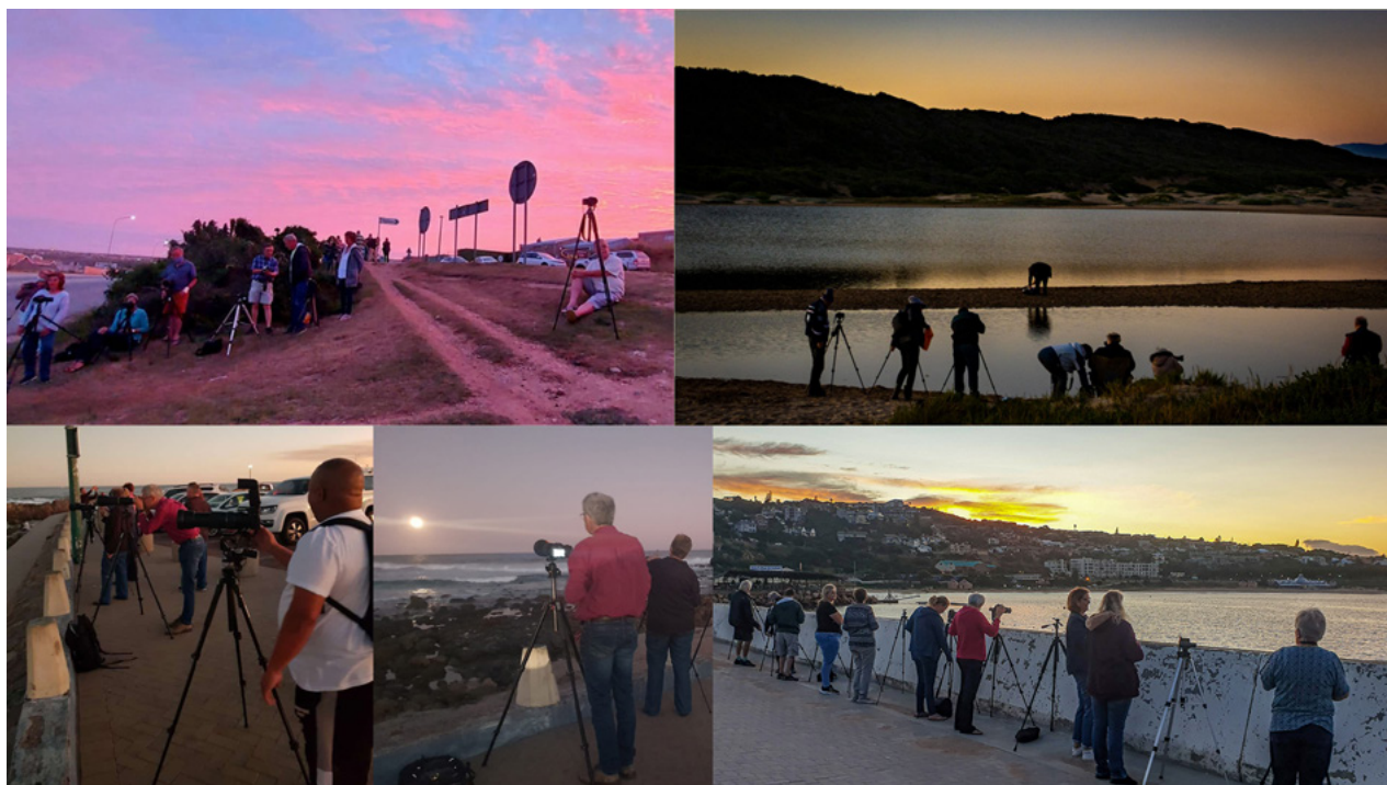
Workshops clockwise from the top: Car light trail workshop, Light paint workshop, ICM workshop, Moon photography workshop (last two).

EPS members are keen to learn as much as possible to improve their photography. Numerous workshops and outings are organised throughout the year on various topics, with workshops often conducted by senior club members (see below and the next page). A few examples are a Light Trail Workshop by Elizabeth Nicholson, a Macro/Close Up