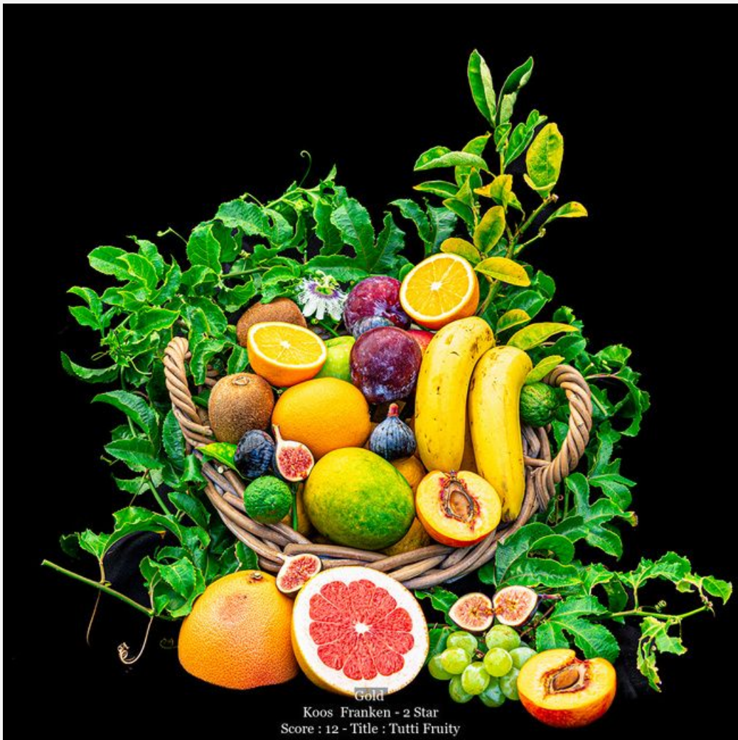
Gold Koos Franken - 2 Star Score : 12 - Title : Tutti Fruity