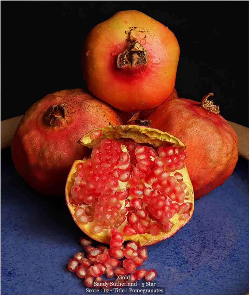
Gold Sandy Sutherland - 5 Star Score : 12 - Title : Pomegranates