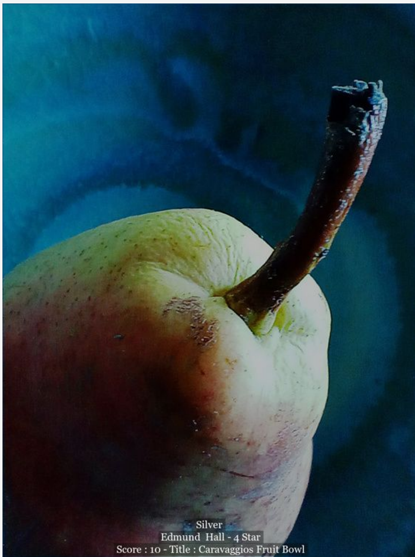
Silver Edmund Hall - 4 Star Score : 10 - Title : Caravaggios Fruit Bowl