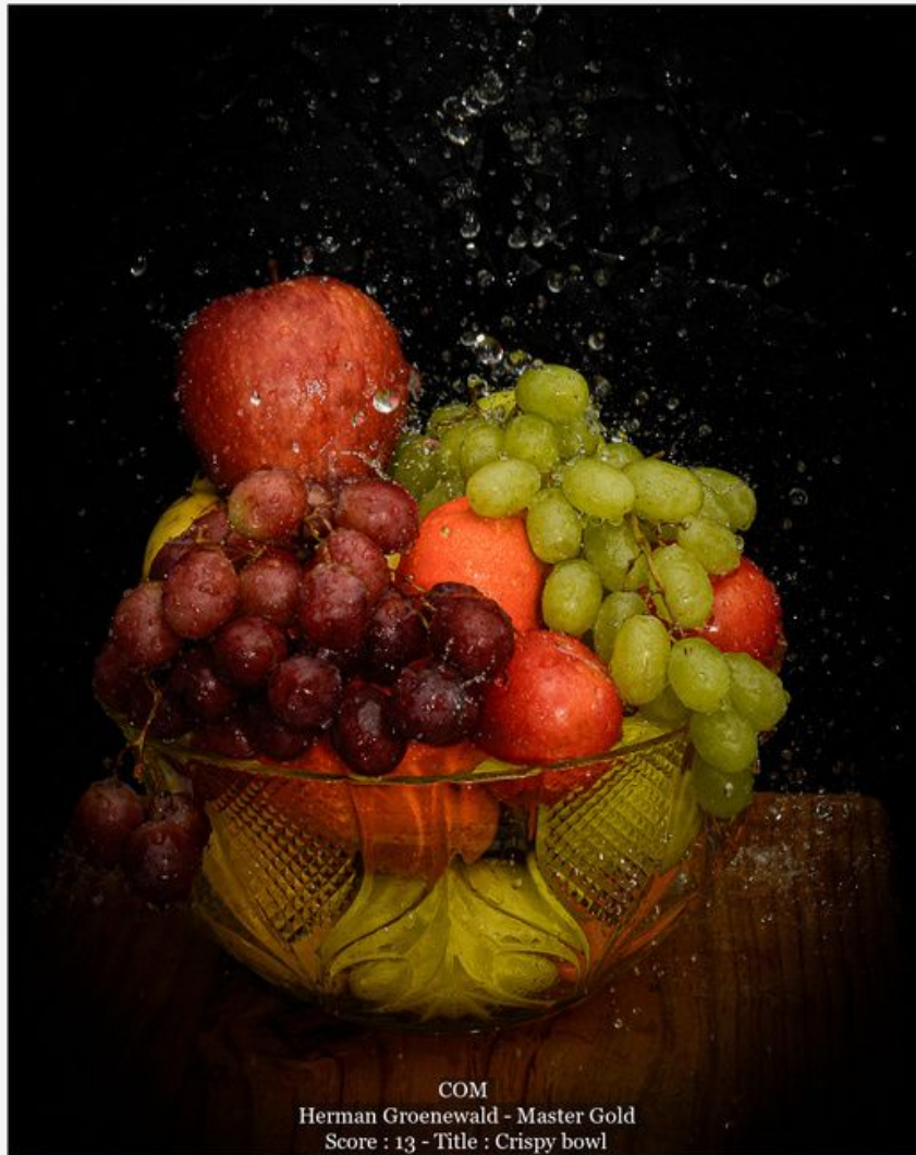
COM Herman Groenewald - Master Gold Score : 13 - Title : Crispy bowl