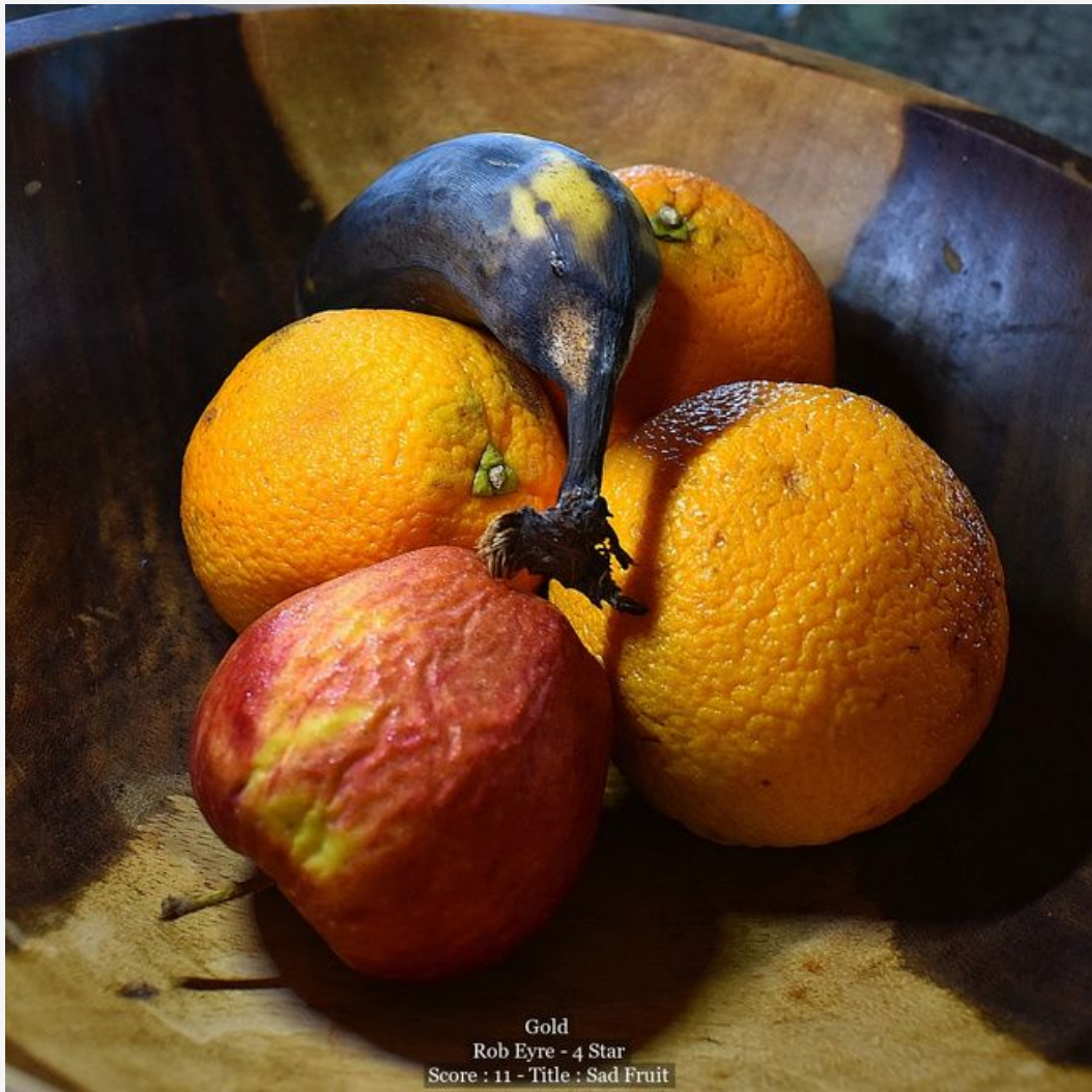
Gold Rob Eyre - 4 Star Score : 11 - Title : Sad Fruit