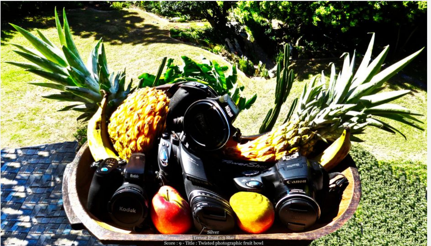
Silver Trevor Frost - 3 Star Score : 9 - Title : Twisted photographic fruit bowl