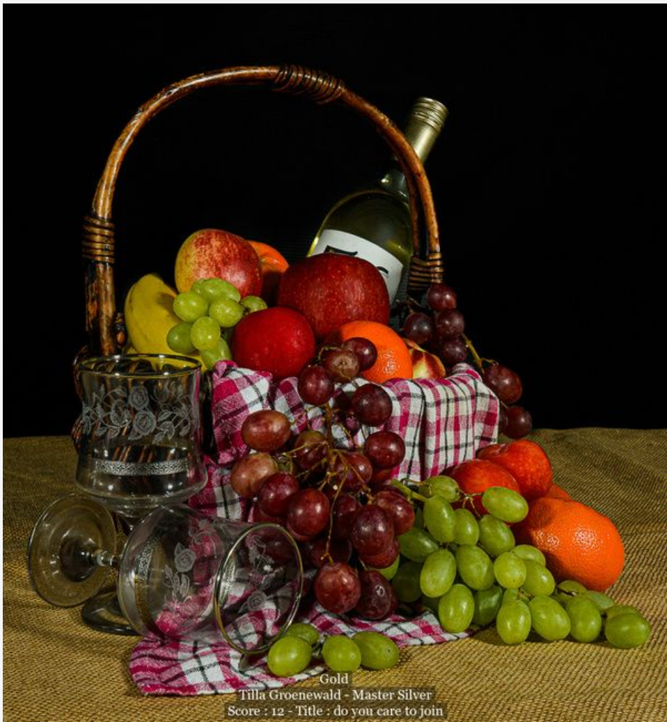
Gold Tilla Groenewald - Master Silver Score : 12 - Title : do you care to join