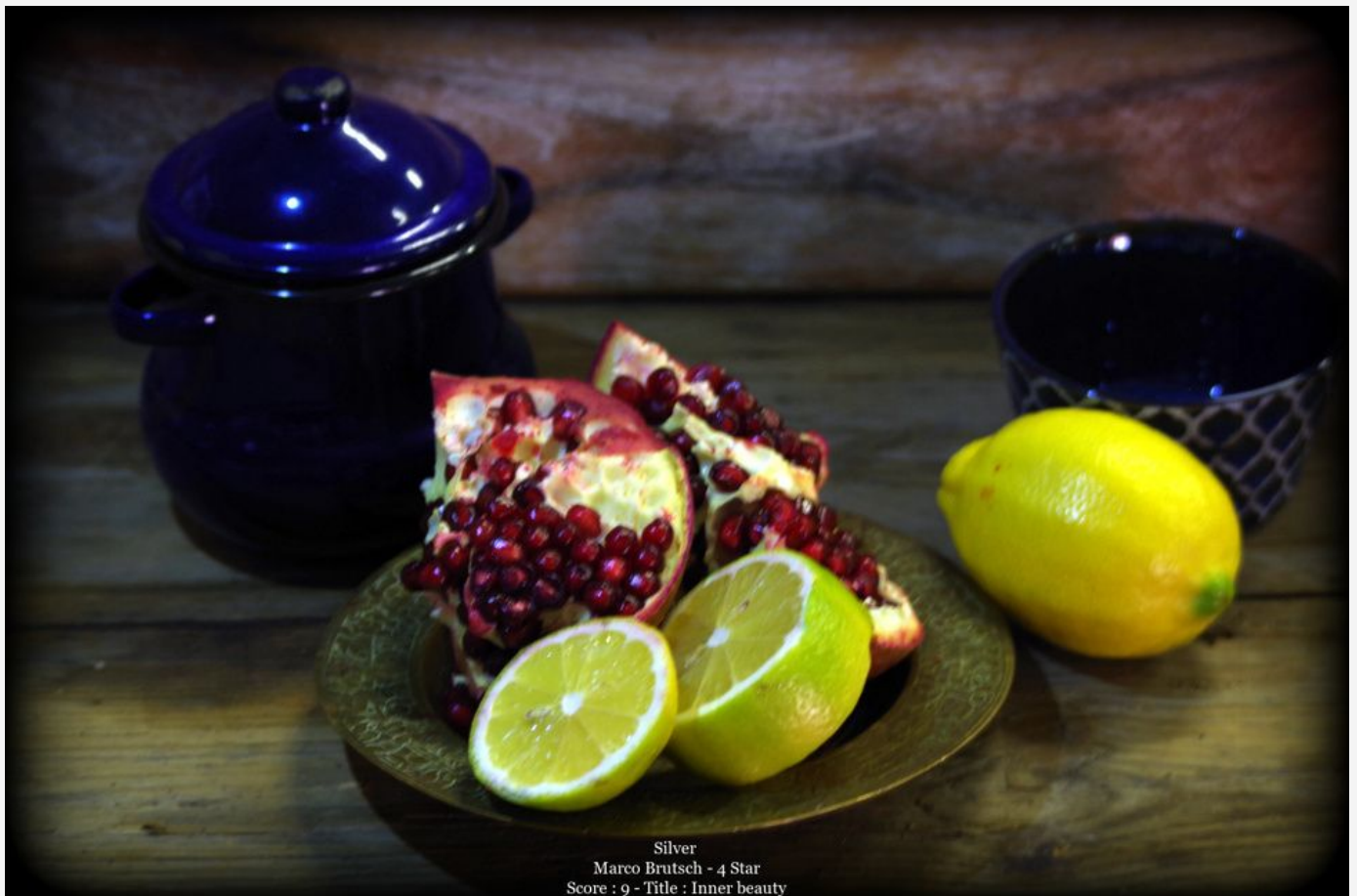
Silver Marco Brutsch - 4 Star Score : 9 - Title : Inner beauty