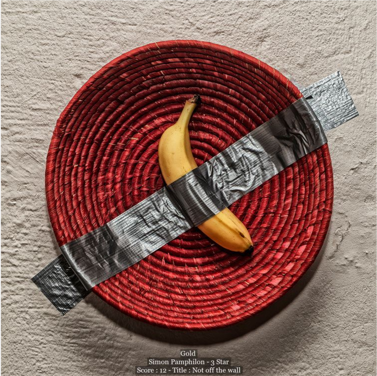
Gold Simon Pamphilon - 3 Star Score : 12 - Title : Not off the wall