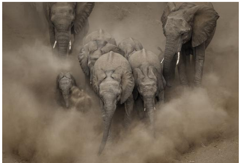
Elephants choking in dust NB - Louis Lötter