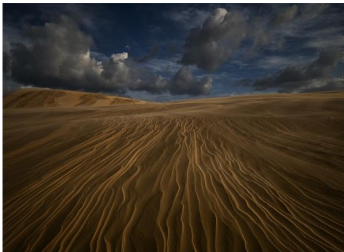
Dunescape - Julia Mukheibir