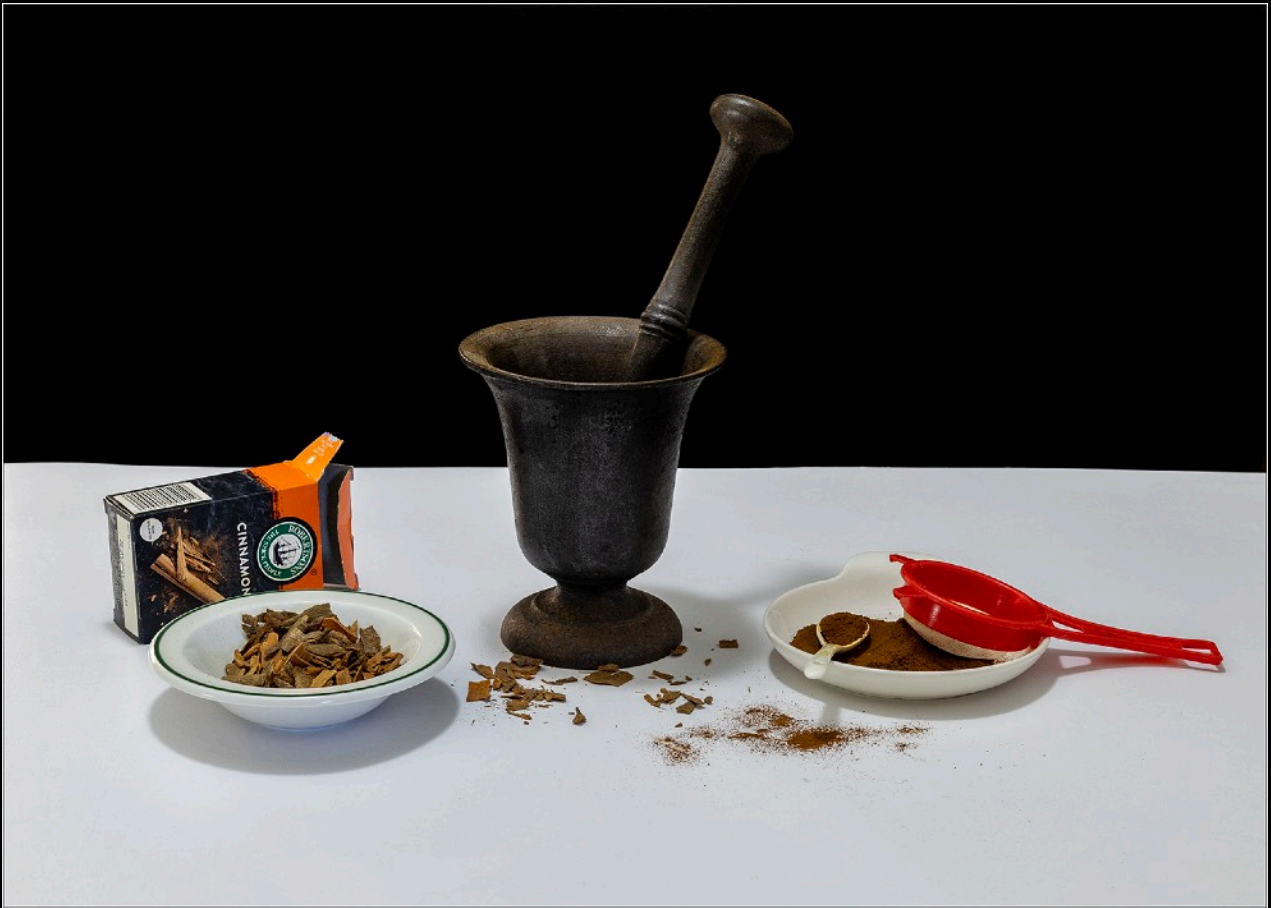
Pancake time