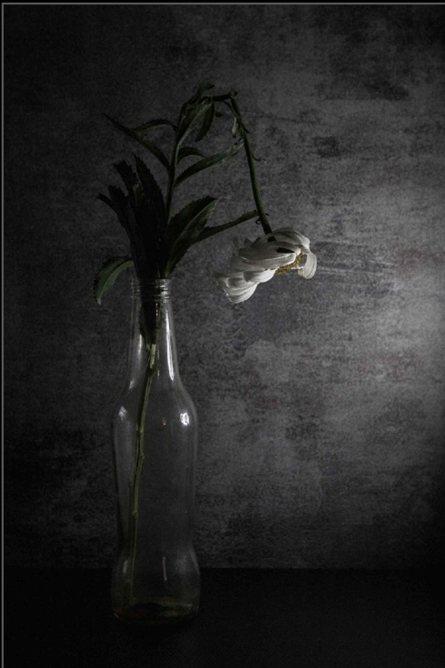
SET SUBJECT WINNER and JUDGE'S CHOICE - JUNIOR