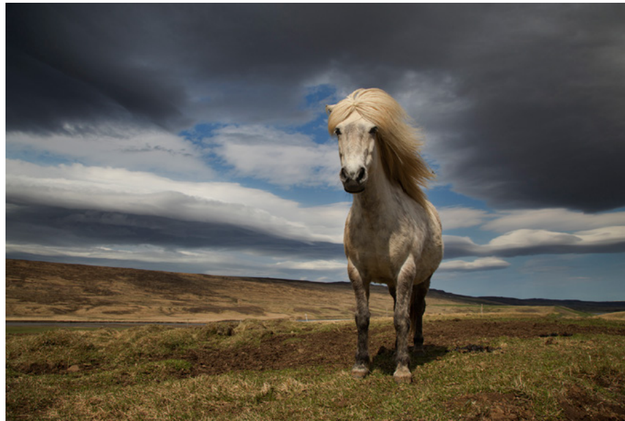
'Ysland perd' by Francois Roux.