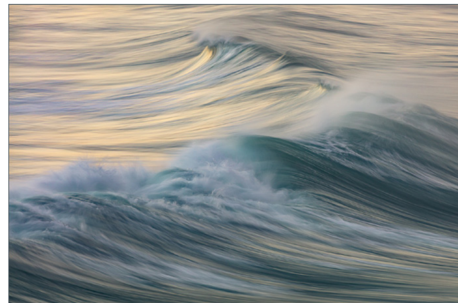
‘Colourful curves’ won a salon medal for Phil Sturgess.

Hermanus photographer Phil Sturgess loves capturing the changing moods, movement and colours of the sea. With this presentation on Sand, sea and surf he’ll provide a simple framework that will help congress delegates develop a photographer’s eye and to see beyond the obvious. Hectic waves and bad weather make good photos, he says – and these will be the prevalent weather conditions during August in Struisbaai and neighbouring L’Agulhas. His presentation should therefore provide ideal guidelines for congress goers interested in capturing the sea scapes on their doorsteps.