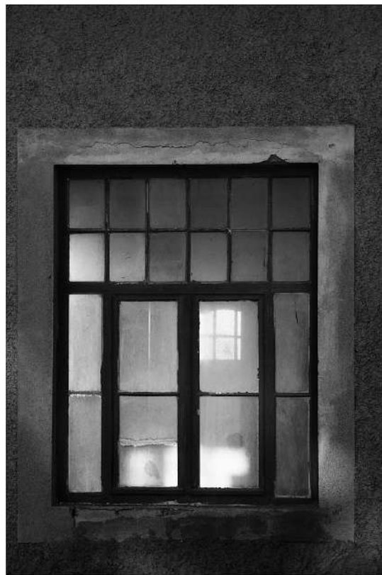
Third Placed Image: A Window in a Window Author: Nettie Warncke Digital, Set Subject, 28 Points