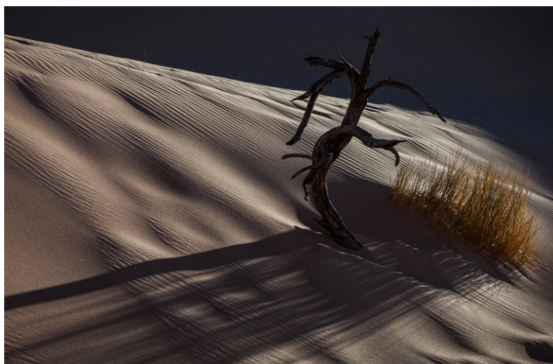
Right: “Dead tree shadows” by Phil Sturgess (Landscape, 23 votes)

The beauty captured was not only from our part of the world, but from wherever our photographers travelled.