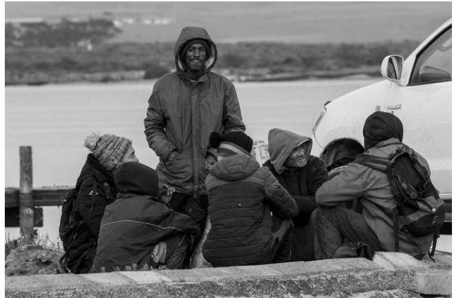
"Waiting" by Wayne Moore – certificate of merit in PSSA Up and Coming salon.