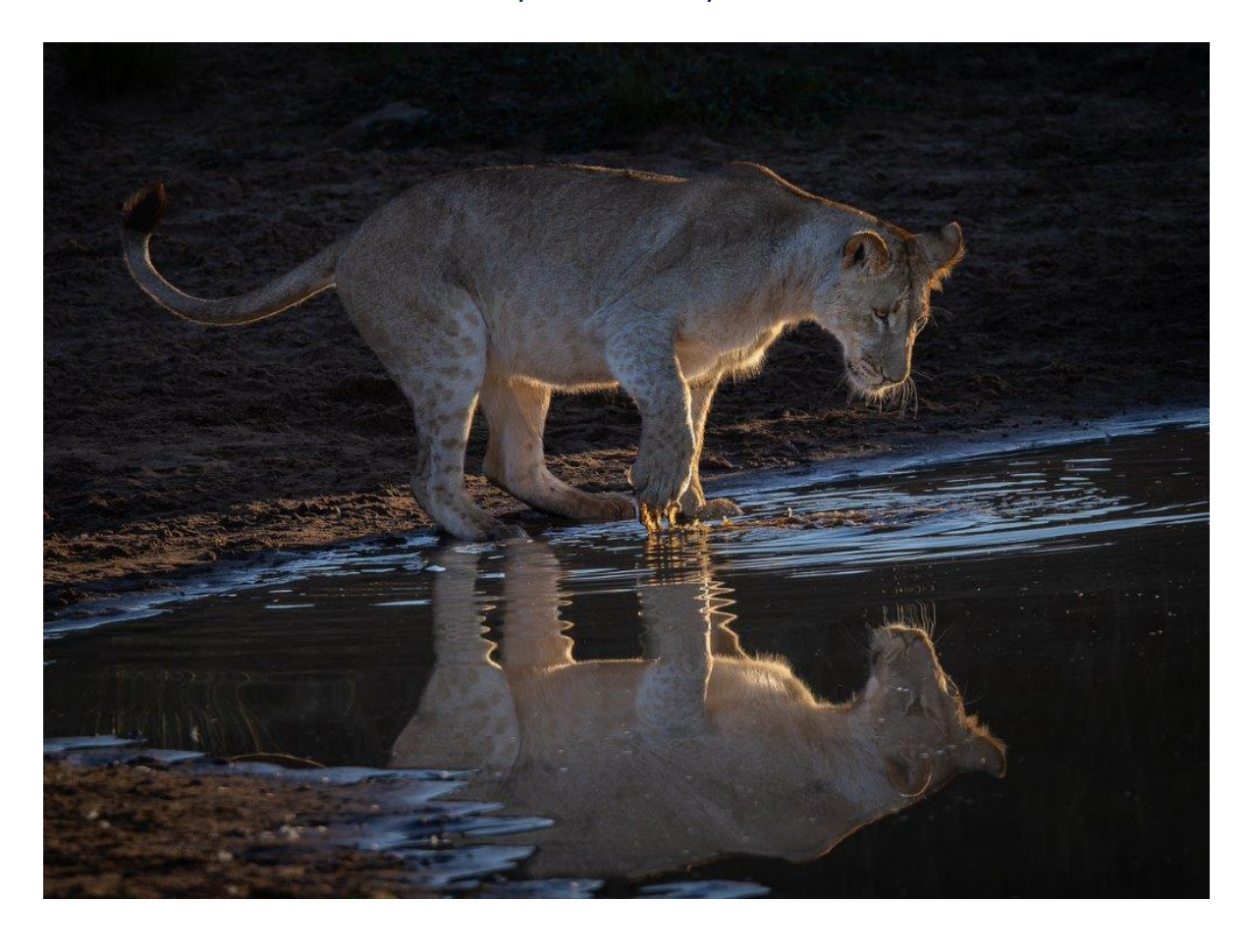
Lion reflection - Pieter Mare