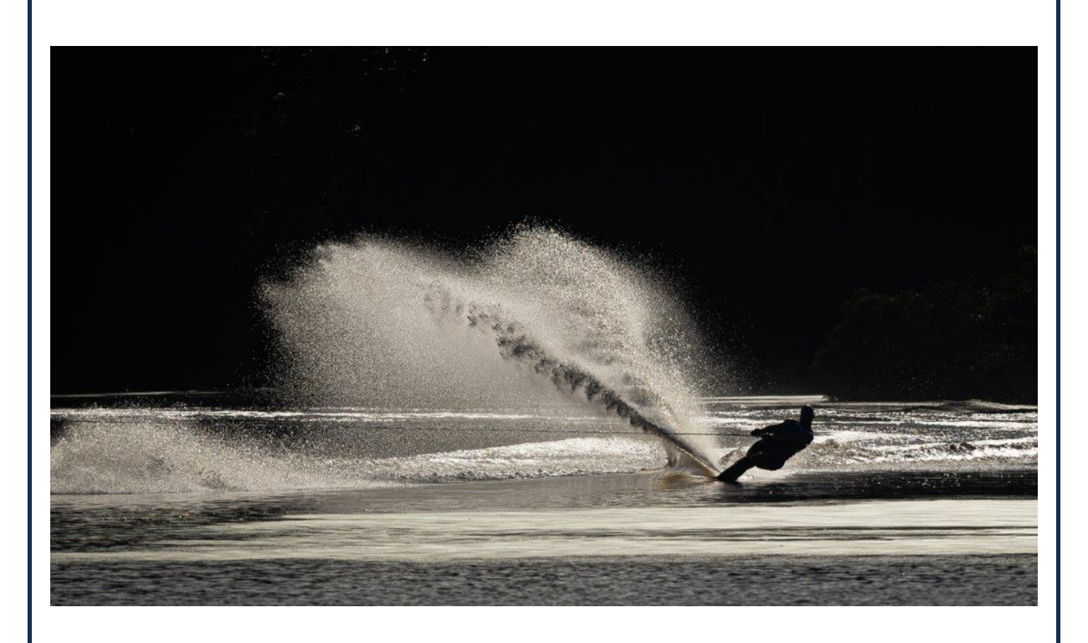
Moonlight warrior - Ettienne Muller (POM to PSSA)