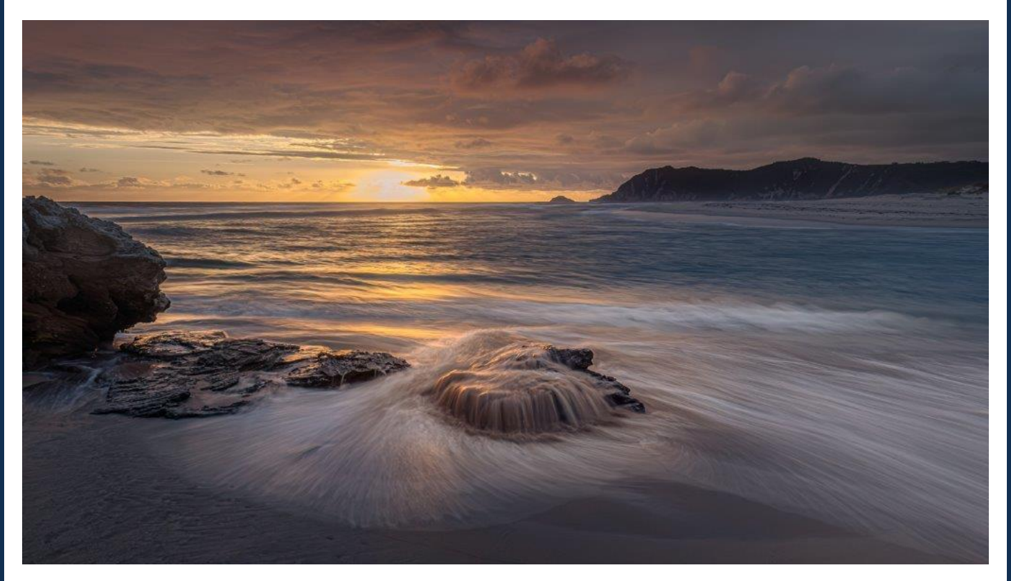
Cloudy sunset - Cathy Birkett