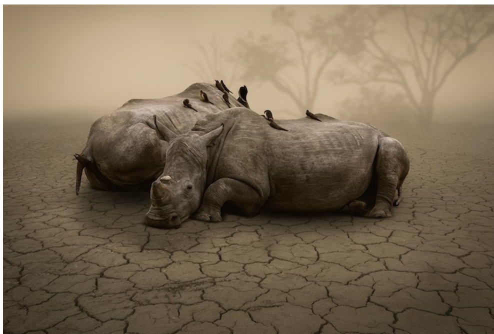
"Waiting for the rain" by Theo Potgieter – composite of three images.

It is not only well composed and impactful, with mood, and story-telling, but is technically so well put