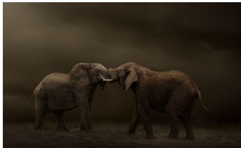
“Clash of the titans” by Theo Potgieter – replaced background and some other changes.

Well, another example of the latter alteration is available. It is a second image by Theo, with which he won another competition in the same month – the one for individual PSSA members.