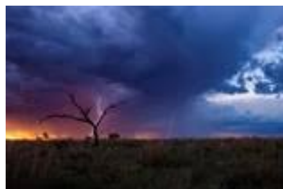
4: Stormy Karoo sky (1Acc)