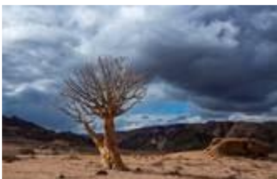
5: Kokerboom with Stormy skies (2Acc)