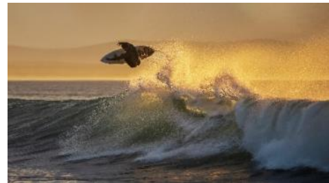
1: Magic wave (3Acc)