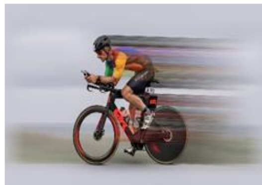
2: Go, go, go 203 (1Acc)