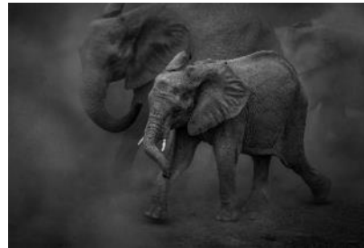
2: Guiding Young Elephant (1Acc)