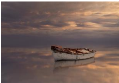
1: Done for the day (2Acc)