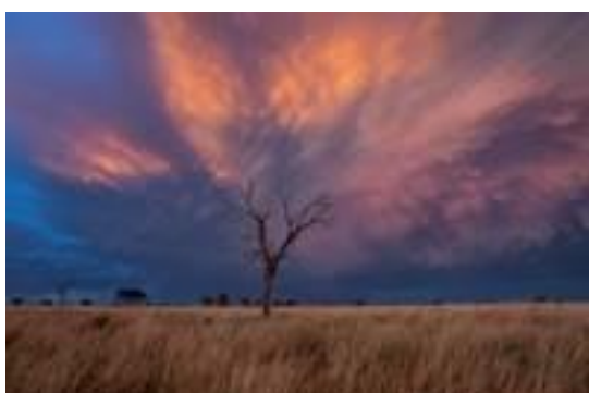
3: Stormy Karoo clouds (2Acc)