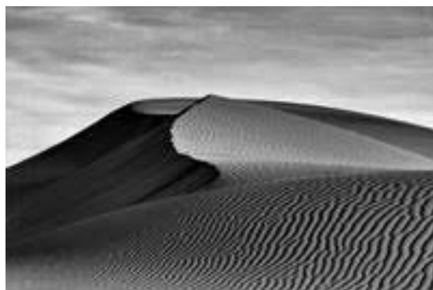
2: Namib dune 2 (1Acc)