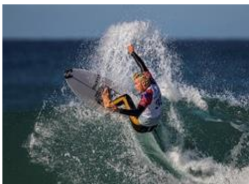
1: Concentration and balance (2Acc HM, ME)