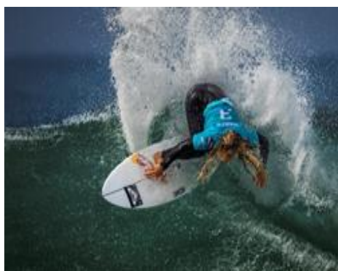
3: Let your hair down (2Acc)