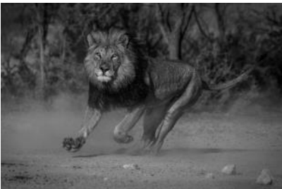
3: Sacrifice for survival (1Med)