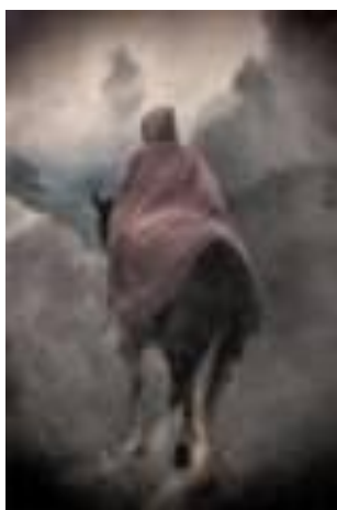
1: Leaving the storm behind me (1Acc)