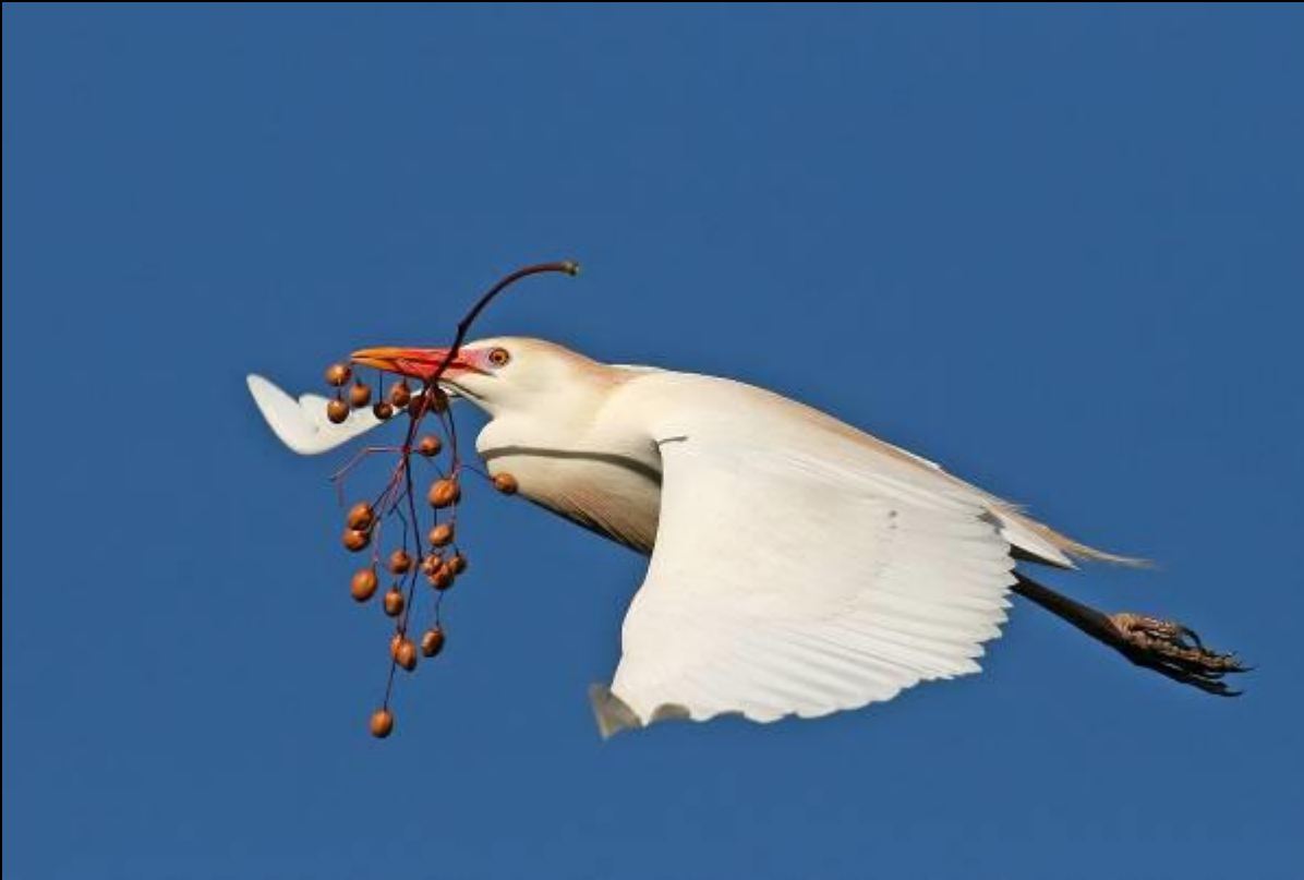
Beginners: Rodnick Clifton Biljon- For the nest