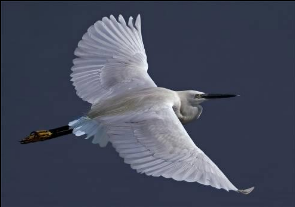
5 Star Master: Theo van der Merwe- Little egret in a turn