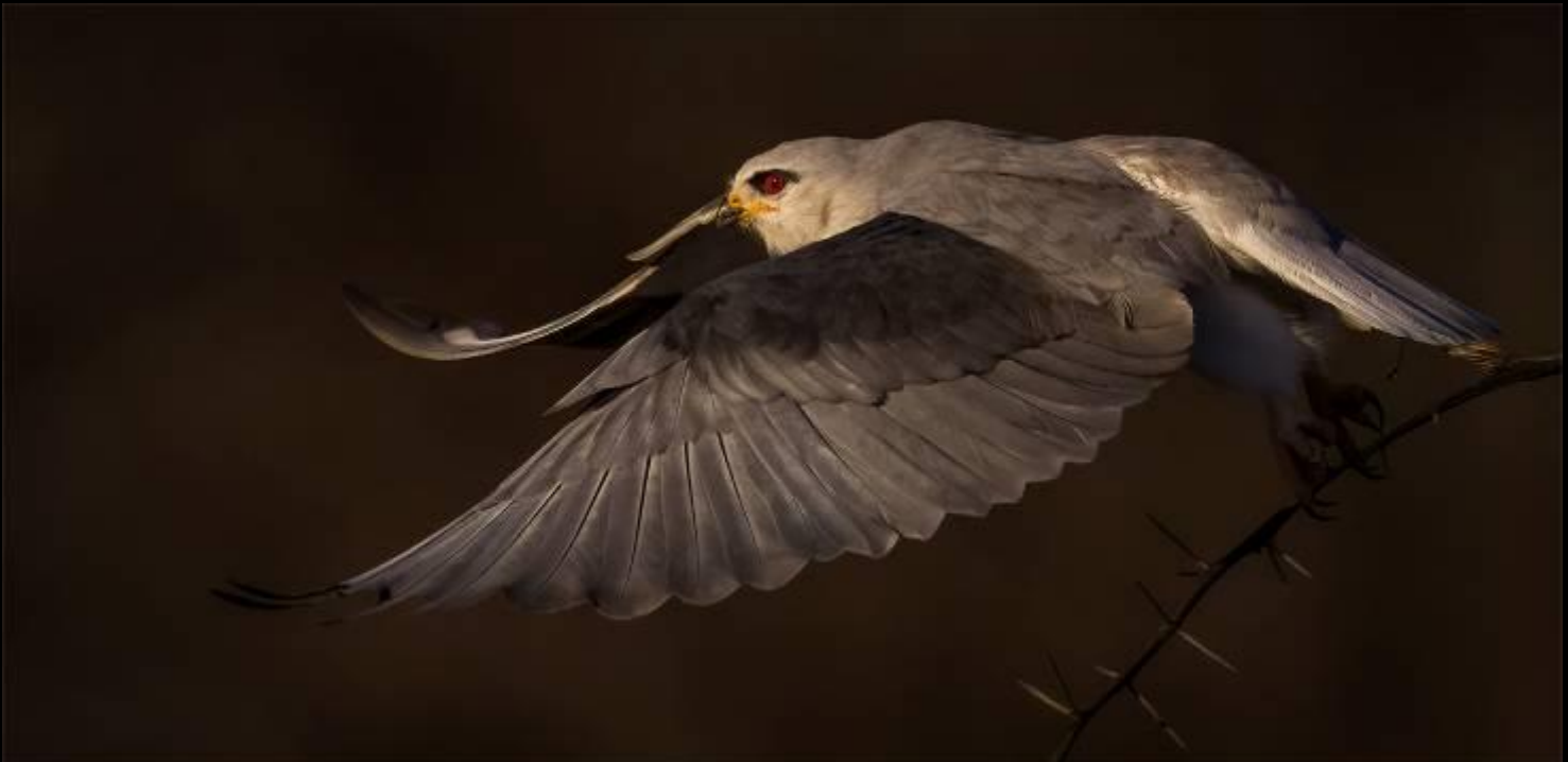
Nature birds: Theo van der Merwe- On the hunt