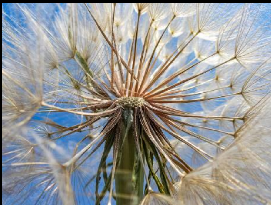
3 Star: Zenia McQuirk- Goats beard dandelion