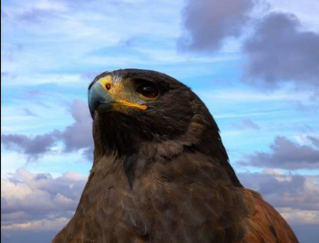
5 Star: Frans Grotius- Watching my prey