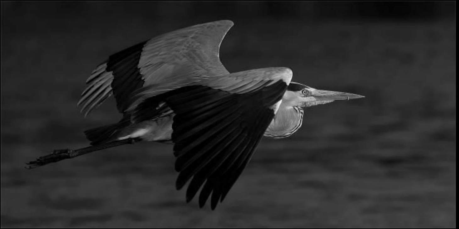
Monochrome: Theo van der Merwe- Swartkop reier in lae vlug