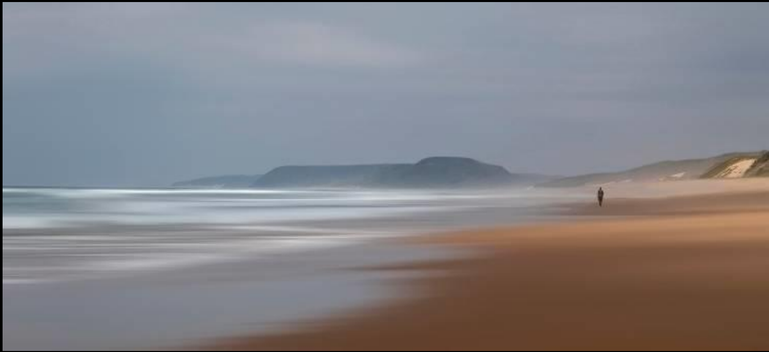
Scapes: Kerry Mellet- Beach Walker