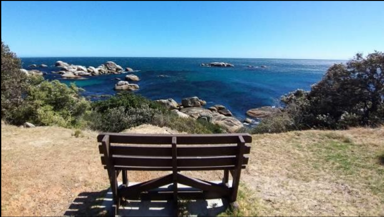
1-3 Star: Zenia McQuirk- Come sit a while and ponder life