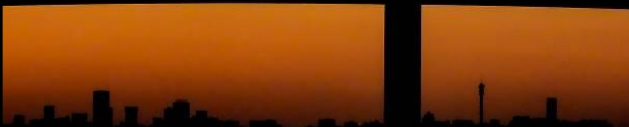
1-3 Star Winner: Zenia McQuirk- JHB evening highway crossing