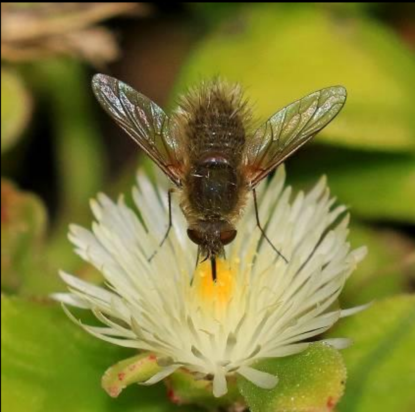
Floral and Still life: Rodnick Clifton Biljon- The sip