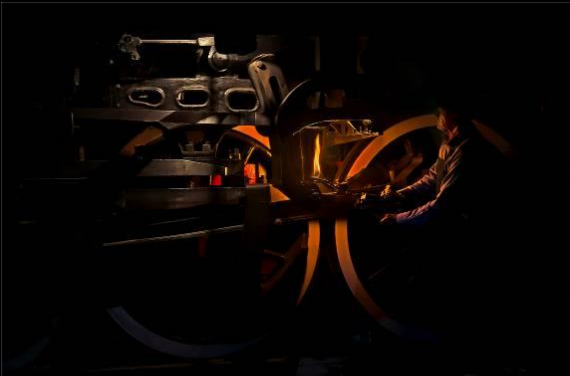
Open pictorial: Theo van der Merwe- By the light of the lamp