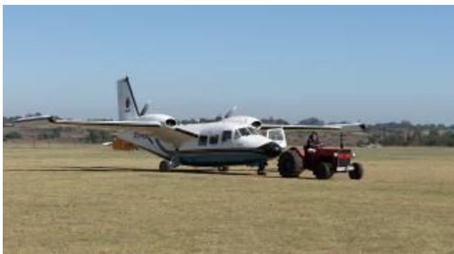
Photo opportunities before the downscaling catered for parked planes and bikes as well as action photos of planes flying low over motorized tricycles and further general airfield activities.

The CERPS interclub competition results were announced, with Edenvale yet again taking the Honours.