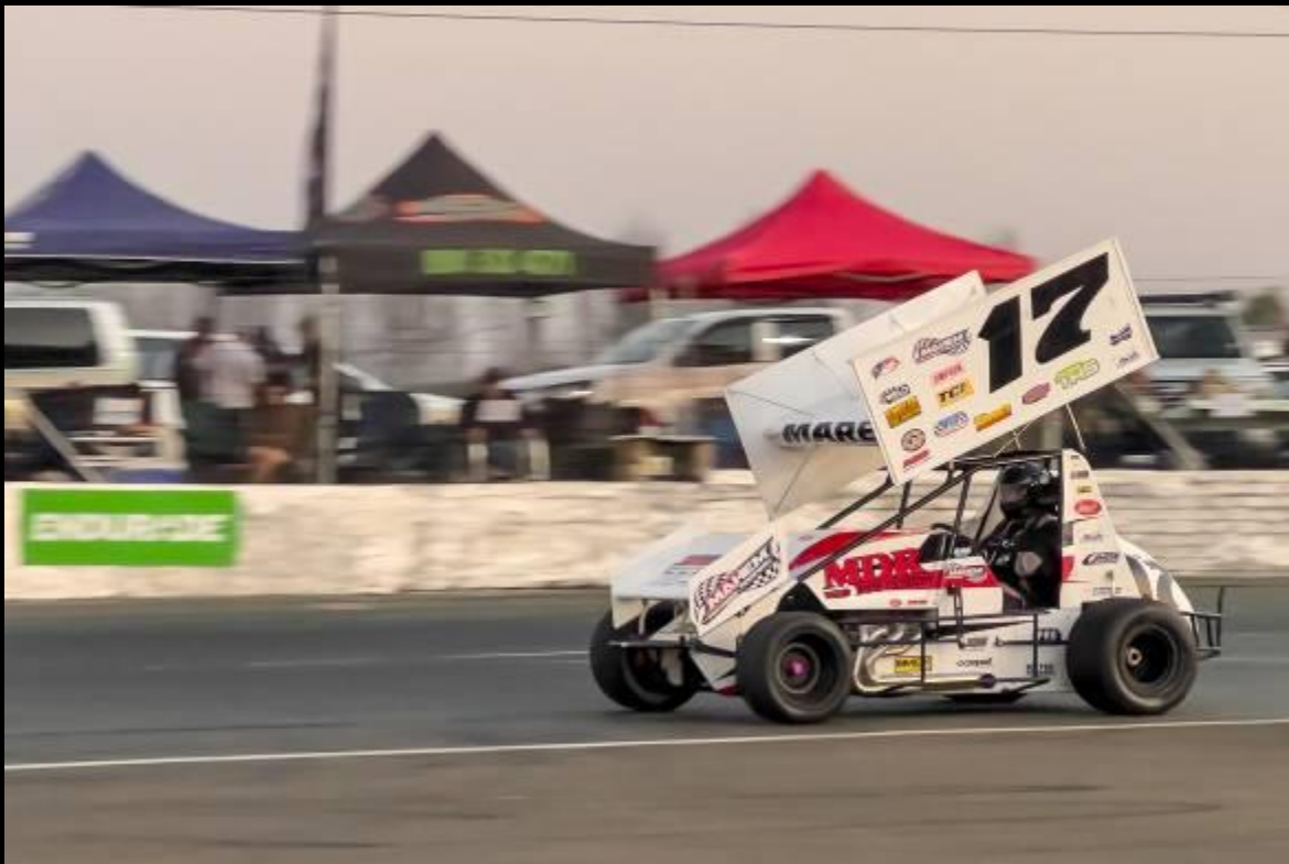
4-5 Star: Hannes Bronkhorst- V8 sprint going flat out