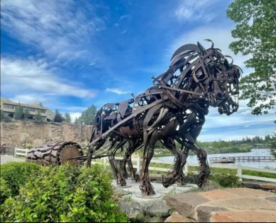
1 Star: Anna-Li van der Merwe- Metal horses