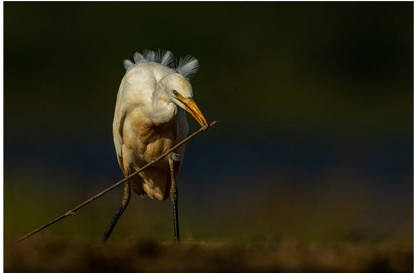
"Nesting material" by Luke Horsten – 51/60 in the Interclub senior category.

In the junior category, for images by photographers up to 3-Star level, which we entered for the first time this year, we ended 29 th out of 44 clubs, and 5 th out of 7 in the Western Cape.