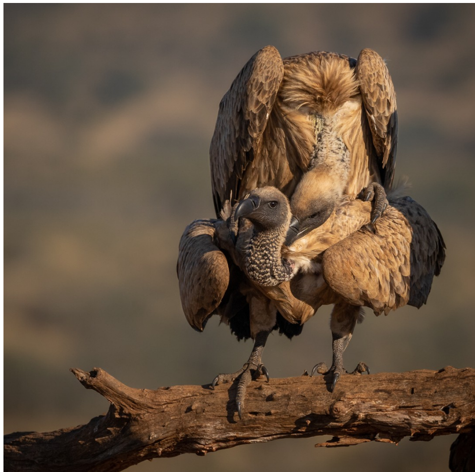
"Vulture passion" by Phil Sturgess, which was awarded a score of 52/60 in the senior category of the 2023 PSSA Interclub competition.

But then, we were the top club in the Western Cape – by a substantial margin.