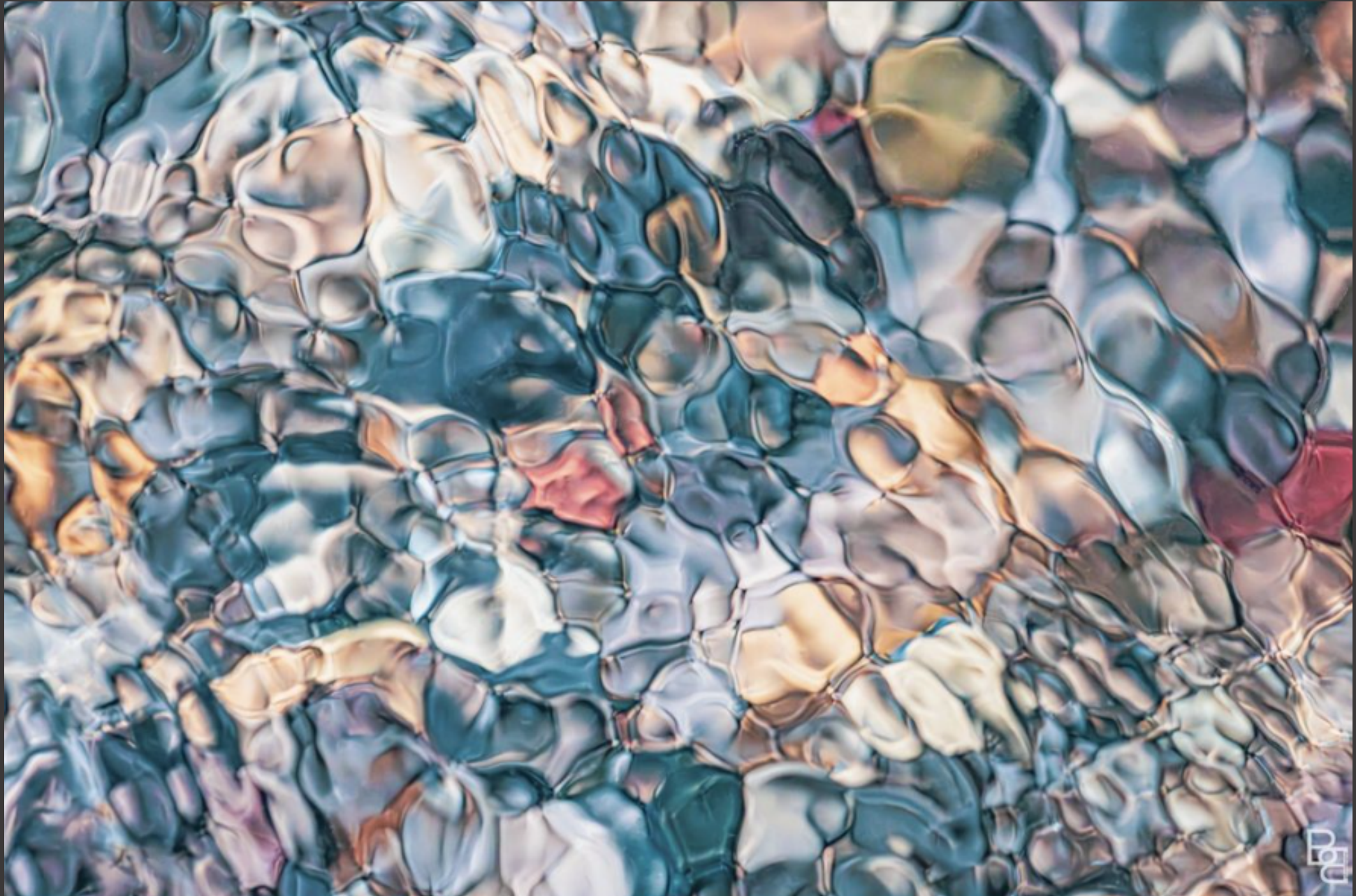
Healing waters – Beth Buelow (copyrighted)