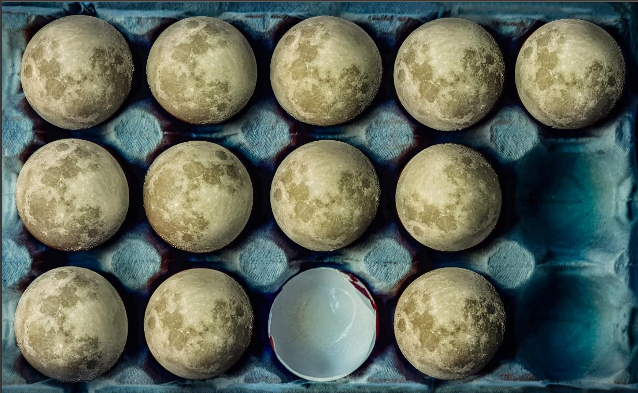
Once in a blue moon – Steff Hughes (copyrighted)