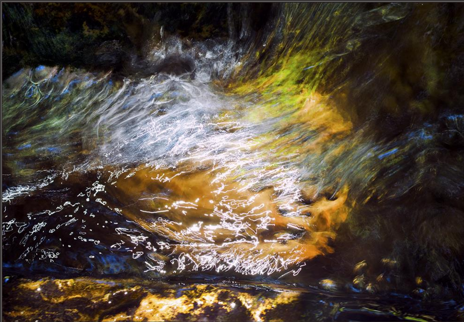
Flowing water – Steff Hughes (copyrighted)