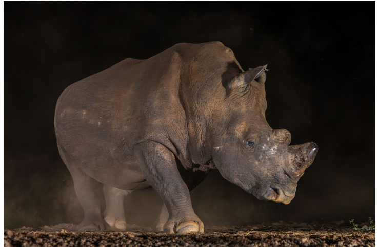
"Dusty show-off" by Charles Naudé – certificate of merit in category Nature (no birds) of Maritzburg salon.

Charles Naudé – 1 Merit award and 2 acceptances