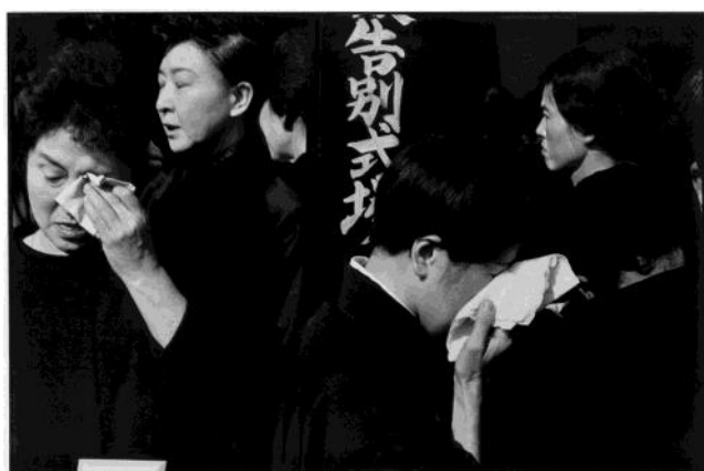
JAPAN. Tokyo. A farewell service for the late actor Danjuro held on Nov. 13th 1965 at the Aoyama Funeral Hall (according to Shinto rites).