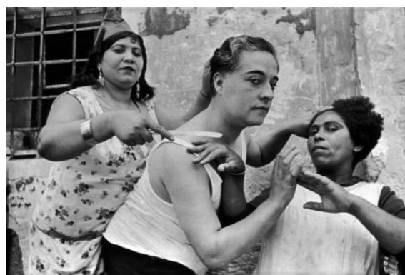
Henri Cartier-Bresson Alicante, Spain 1933