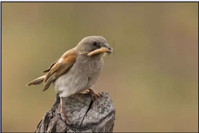
13th — "Bugged Up" by Catriona Borman