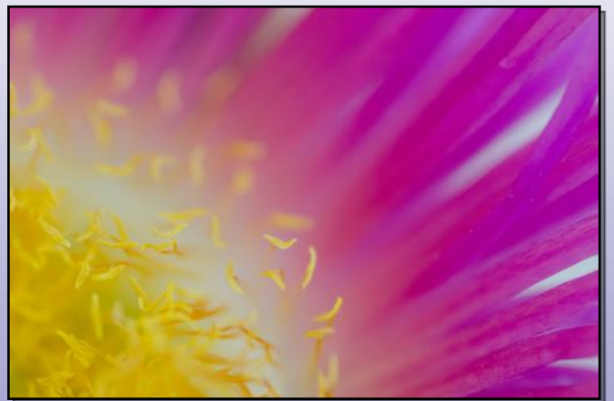
14th — "Flower Detail" by Catriona Borman