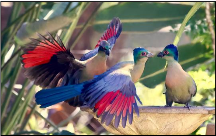
11th — "Purple Crested Turaco" by George Fleet