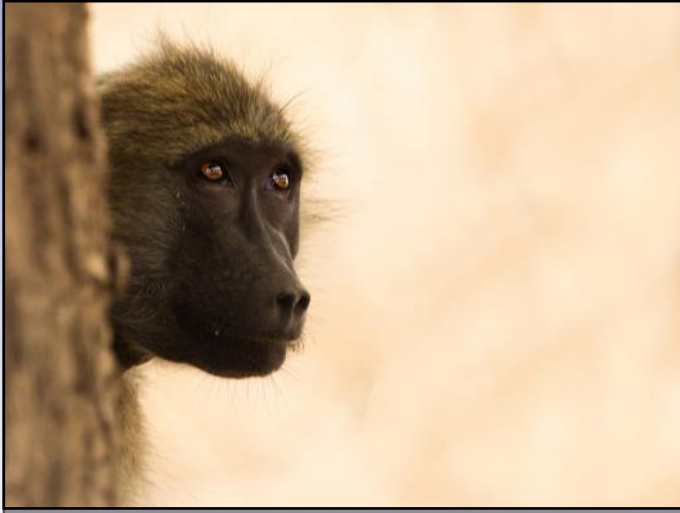
9th — "Peering Out" by Nettie Rogers