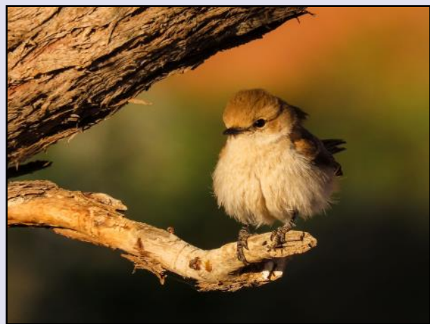
6th — "Still Hunt" by Kerry Orphanides