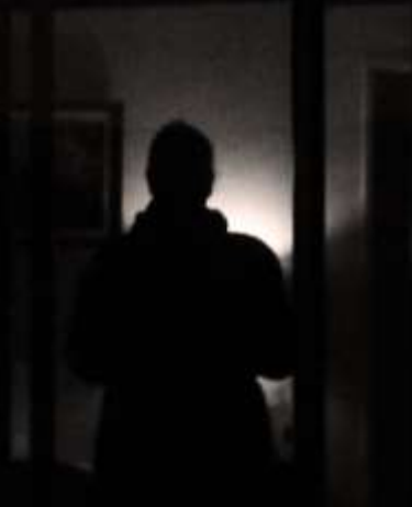
"Patio Morning Reflection"