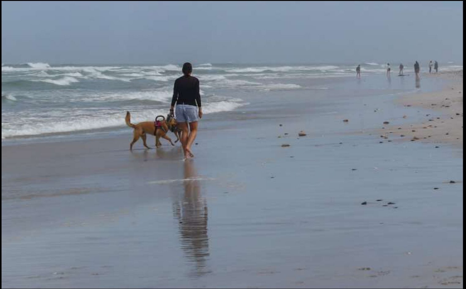
"Human Reflections" - Penny Shaw