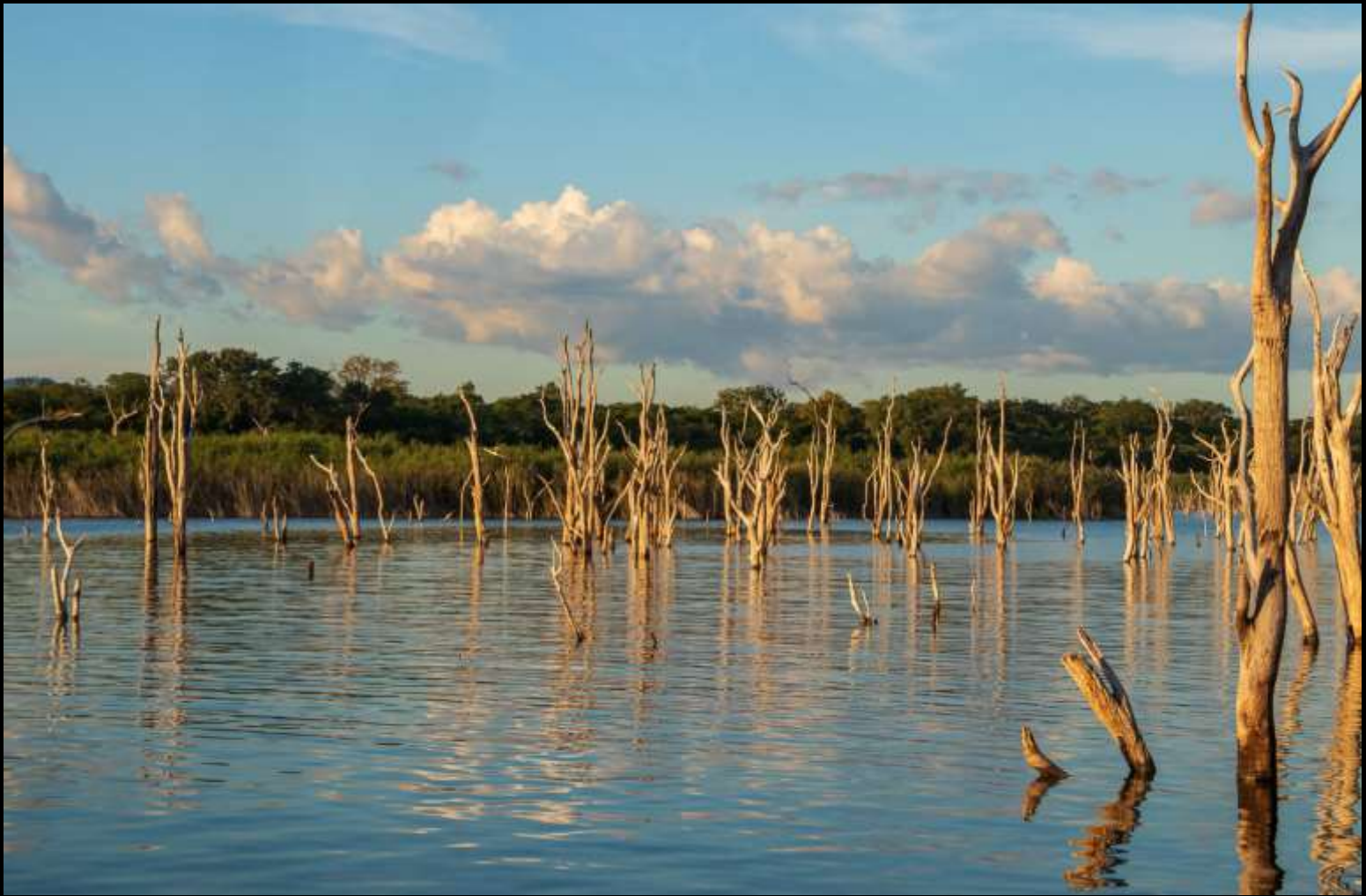
"Fossilised trees in Kariba" - Penny Shaw