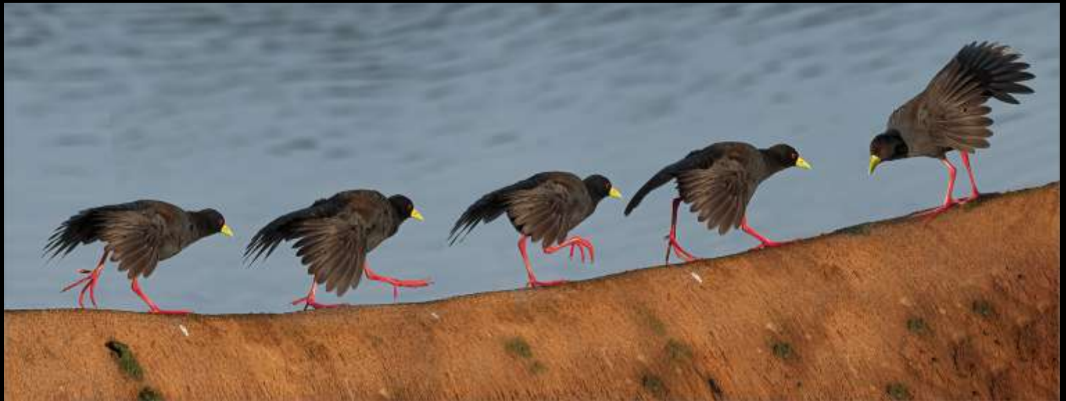
"Stop Right There" - Shirley Swingler