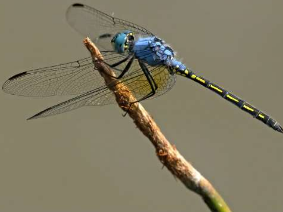
“Dropping on a Reed” - Chris Swingler