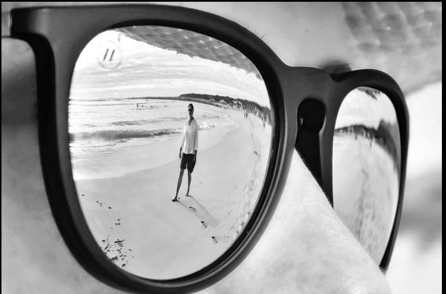
"Seaside Reflections" - Toni le Roux