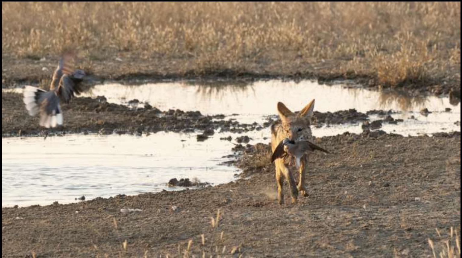
"Lunch is Served"