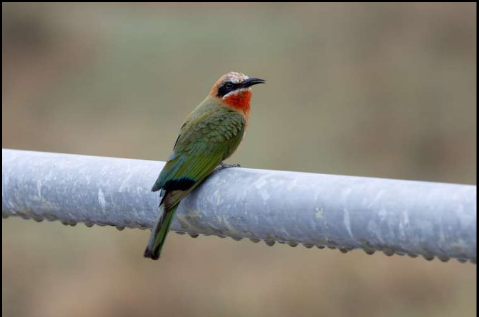
"Damp Bee Eater" - Bradley Henderson