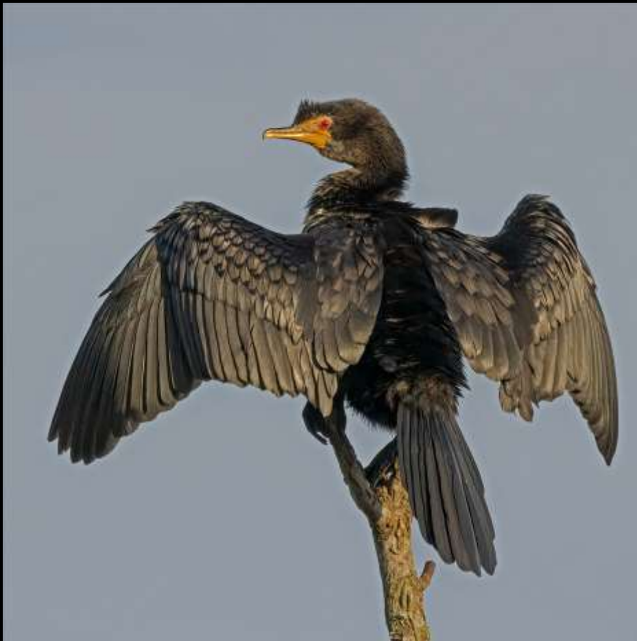
"After a Swim" Chris Swingler