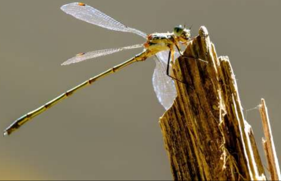
"Dragonfly" - Andrew Black