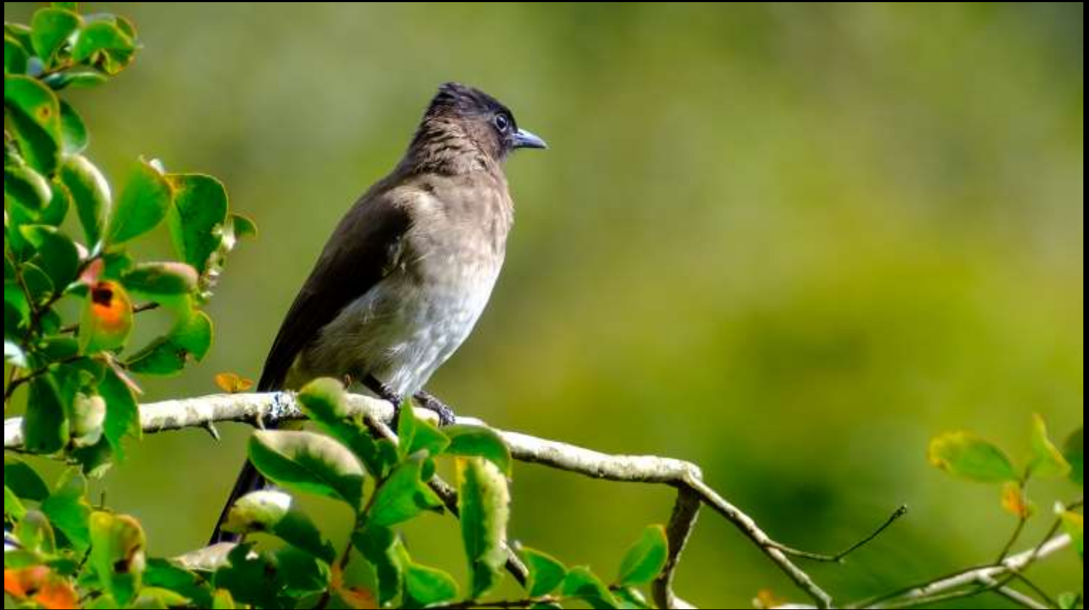
"Bulbul" - Andrew Black