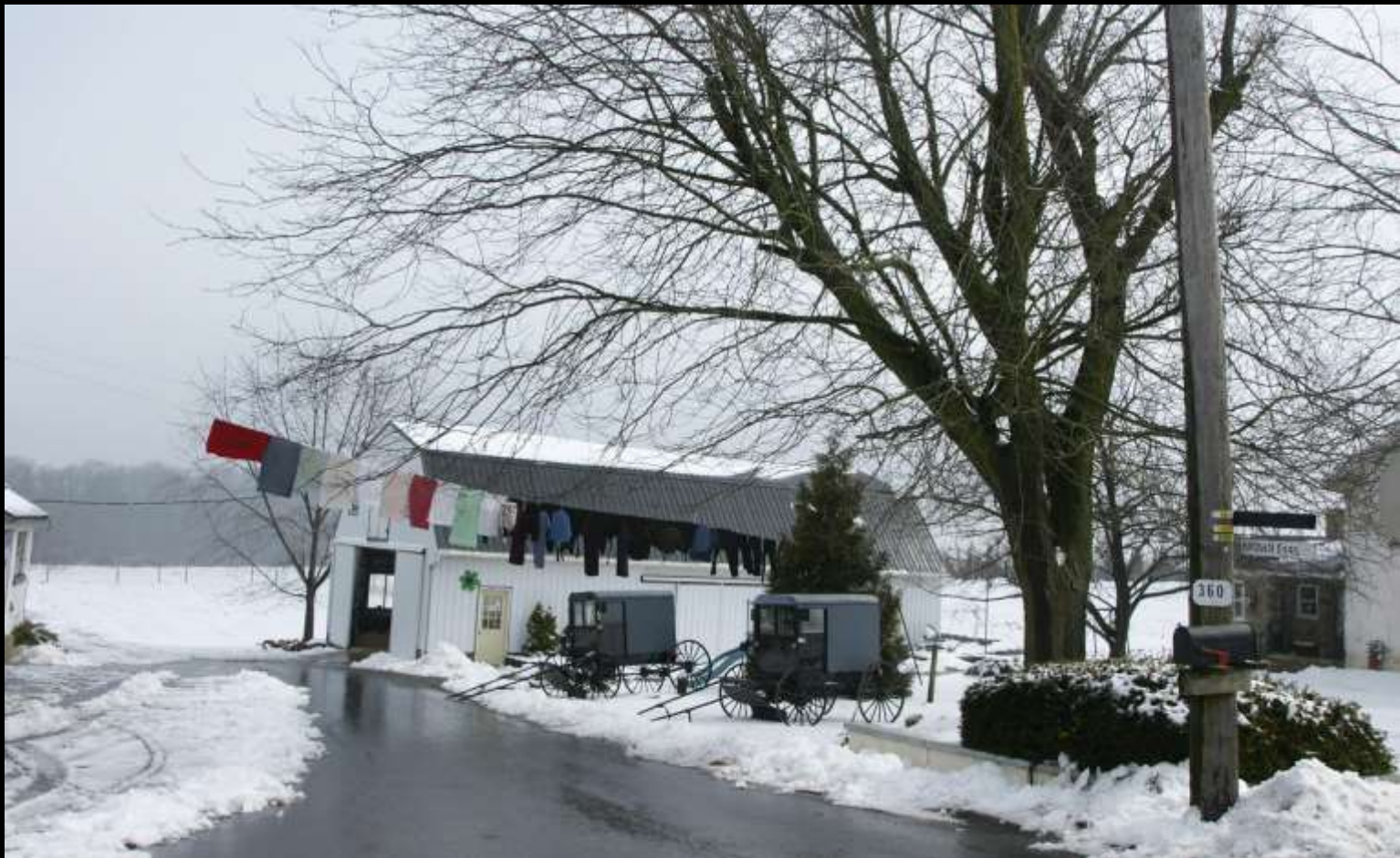
"Snowy Laundry Day" - Sue Grills