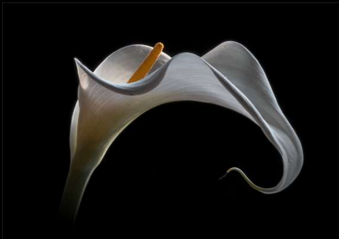
“Waves of Wonderment”