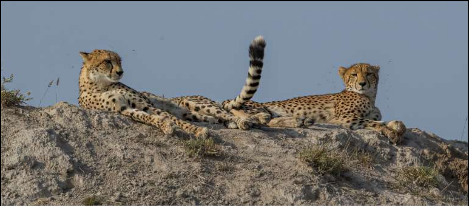
"Sharing a Tail" Shirley Swingler