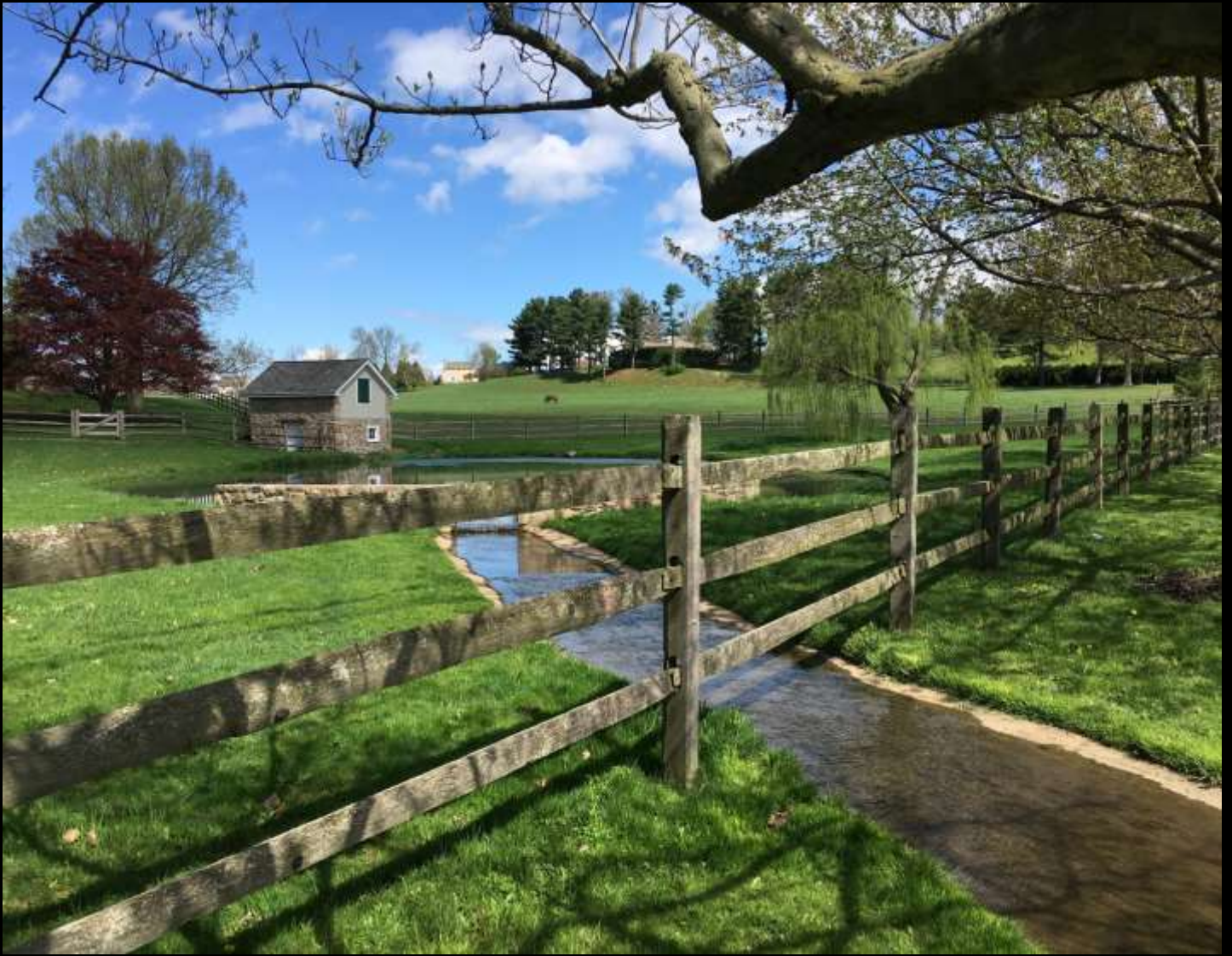
"Restored Spring House" - Sue Grills