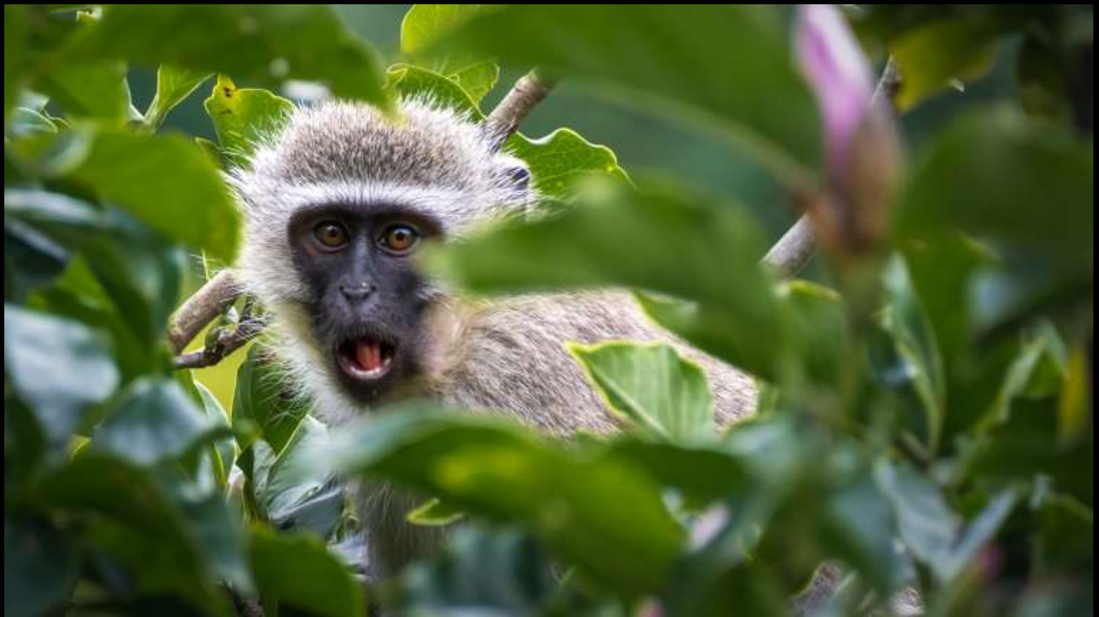
"Caught" - Andrew Black