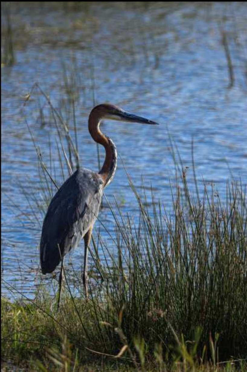
"Goliath Heron"