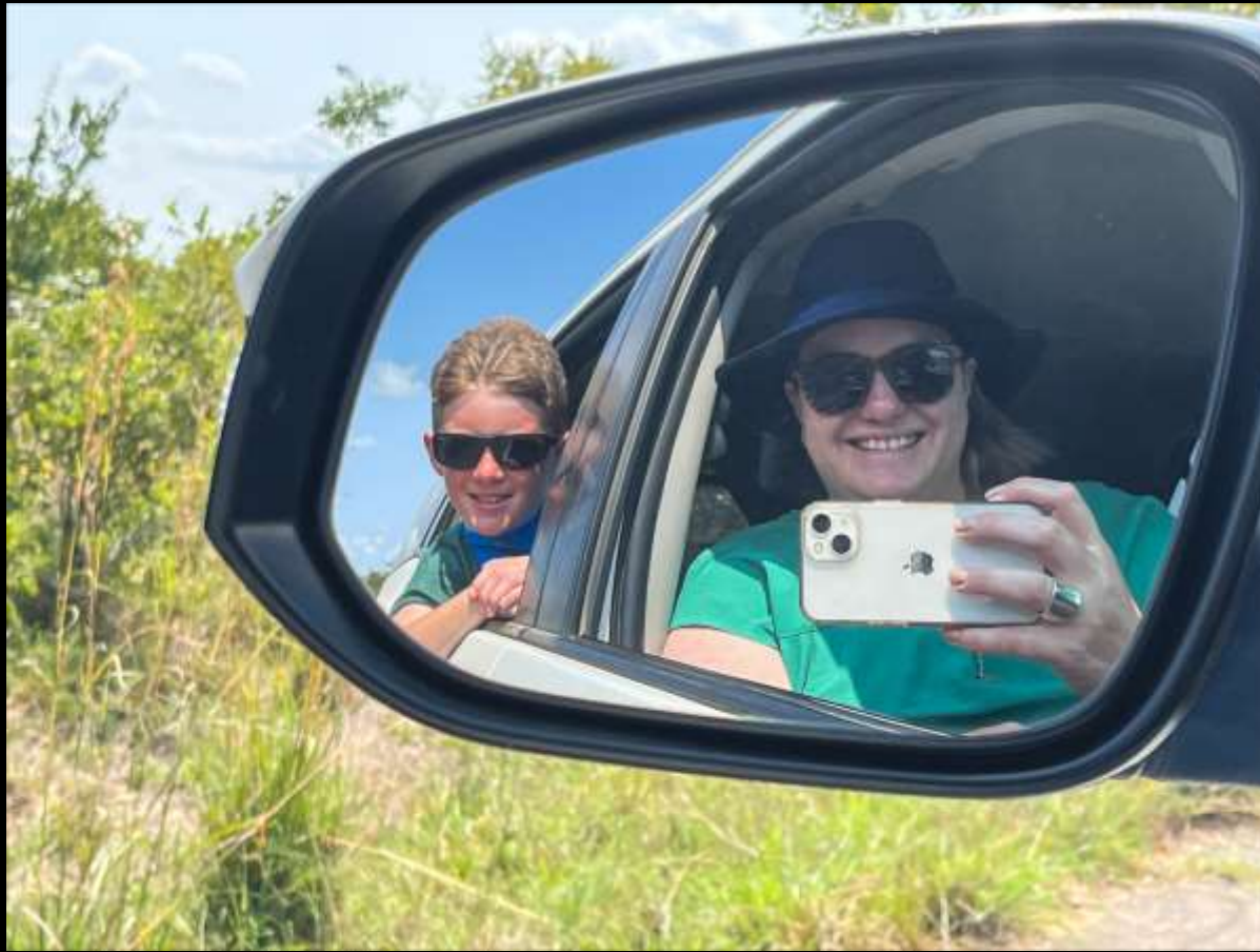
"Game Drive Reflections"