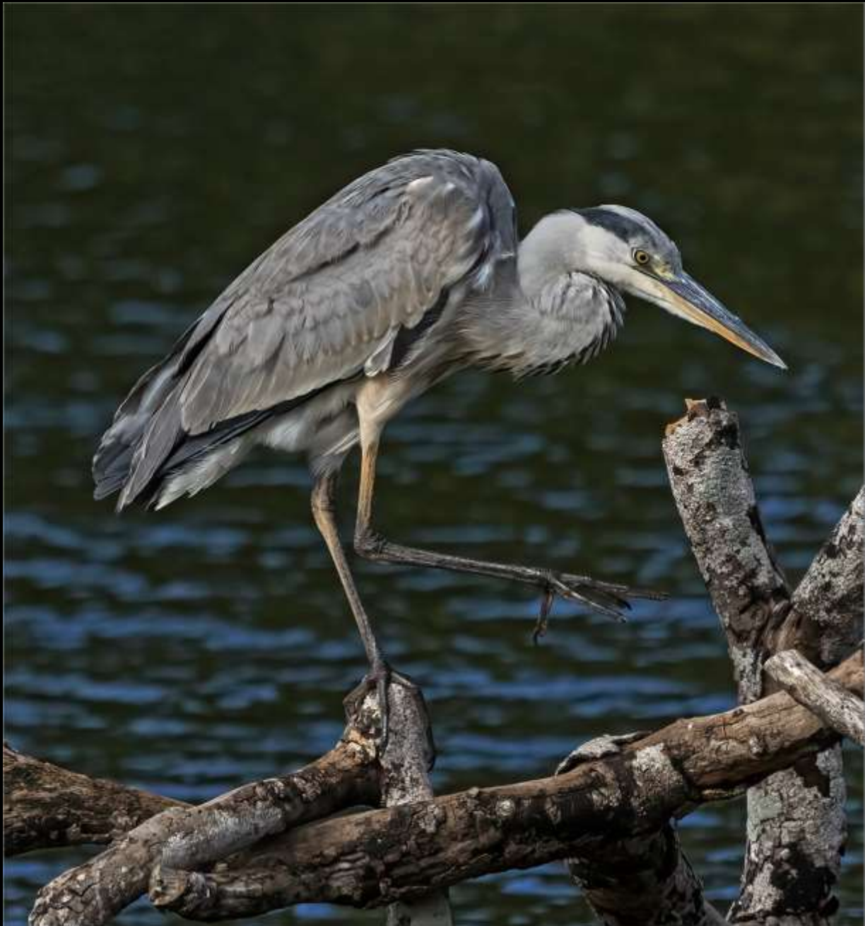
"Stepping Out" - Chris Swingler