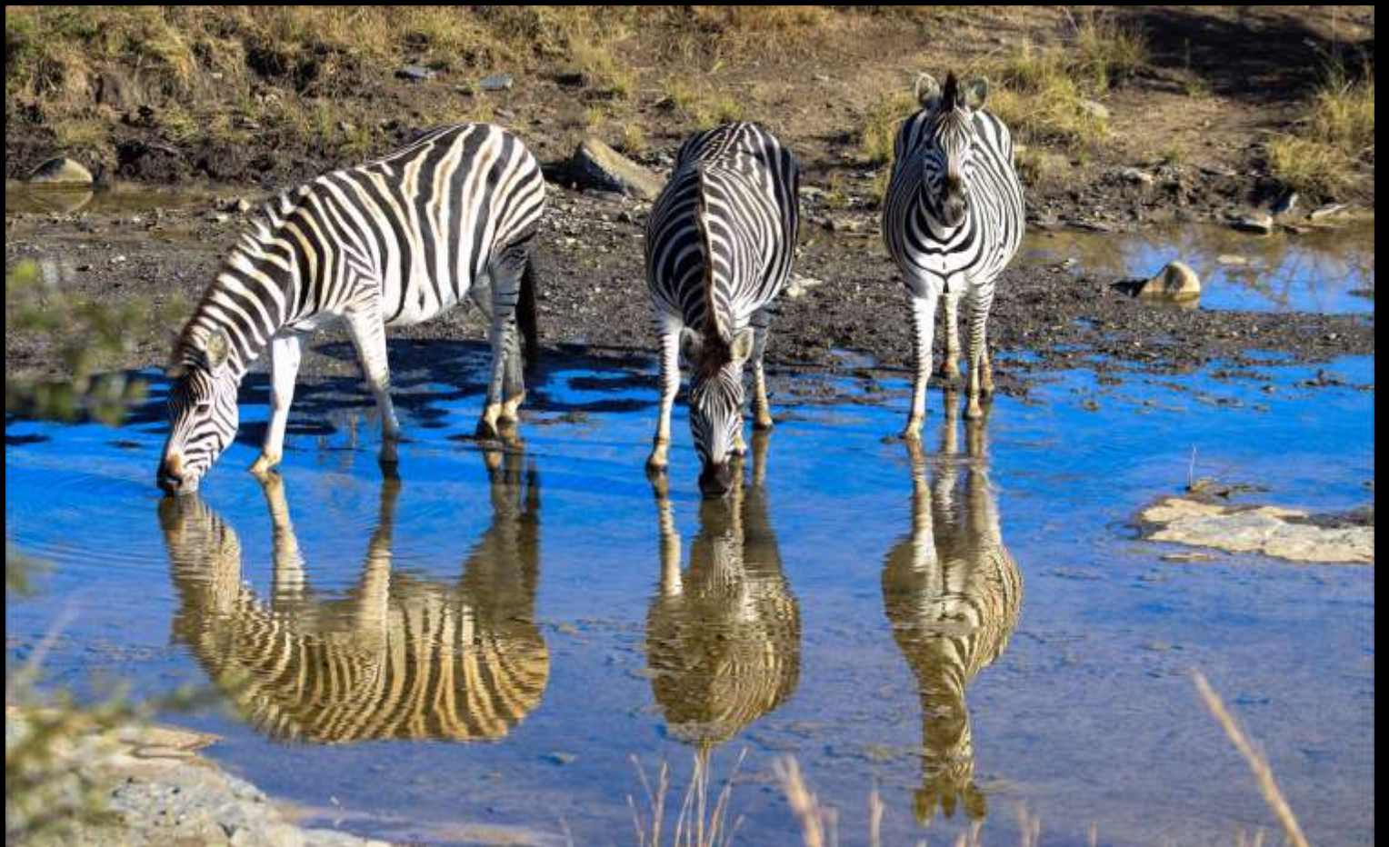
"Perfect Early Morning Reflection" Rob Ainslie