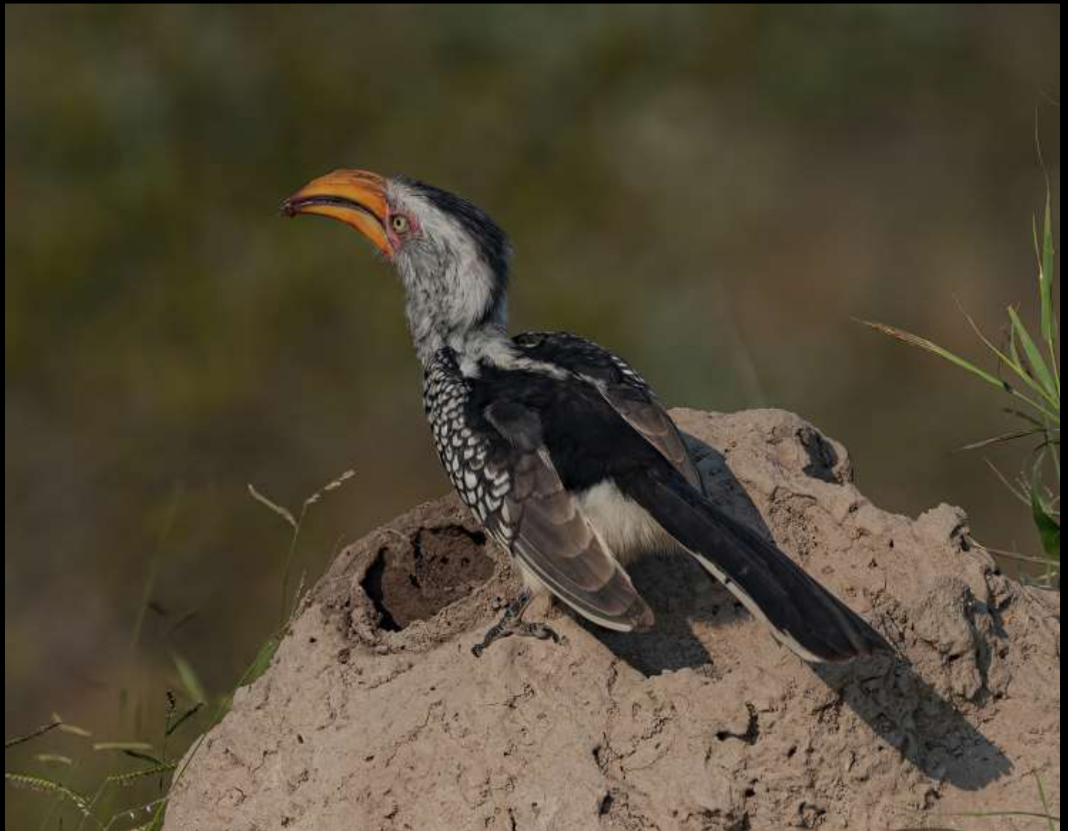
“Termite Terminator” Shirley Swingler