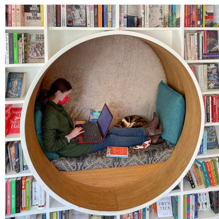
"Bookworm" by David Wilson - FIAP Blue ribbon for category runner-up in Good Light international salon