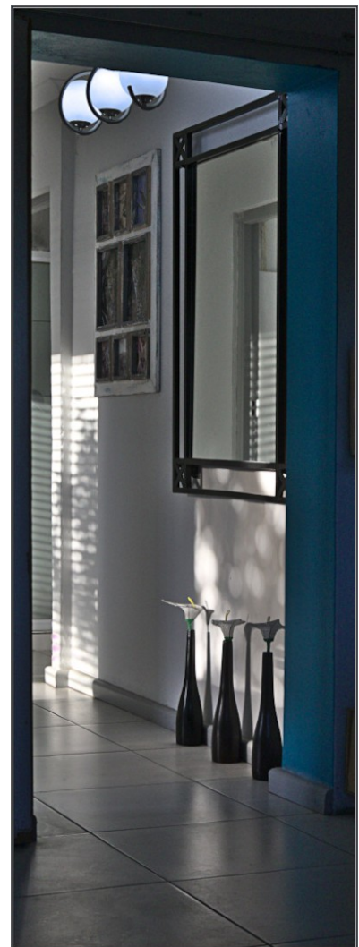
"Late Afternoon Light and Shadow" by Kobus Botes - winner of the June set subject, Painting with Light

SANParks Boland honorary rangers nature only 25 June