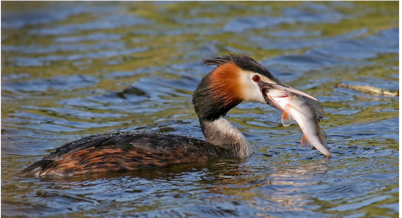
Nice catch – Willem de Voogt