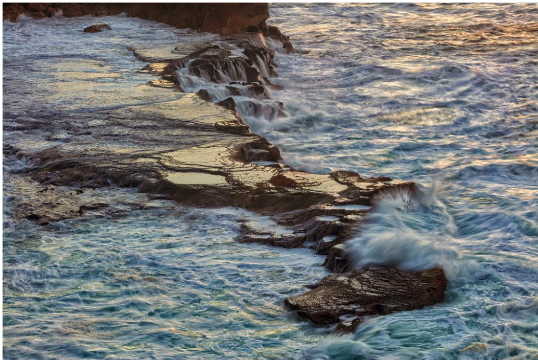
Rocky Sunrise – Des Kleineibst