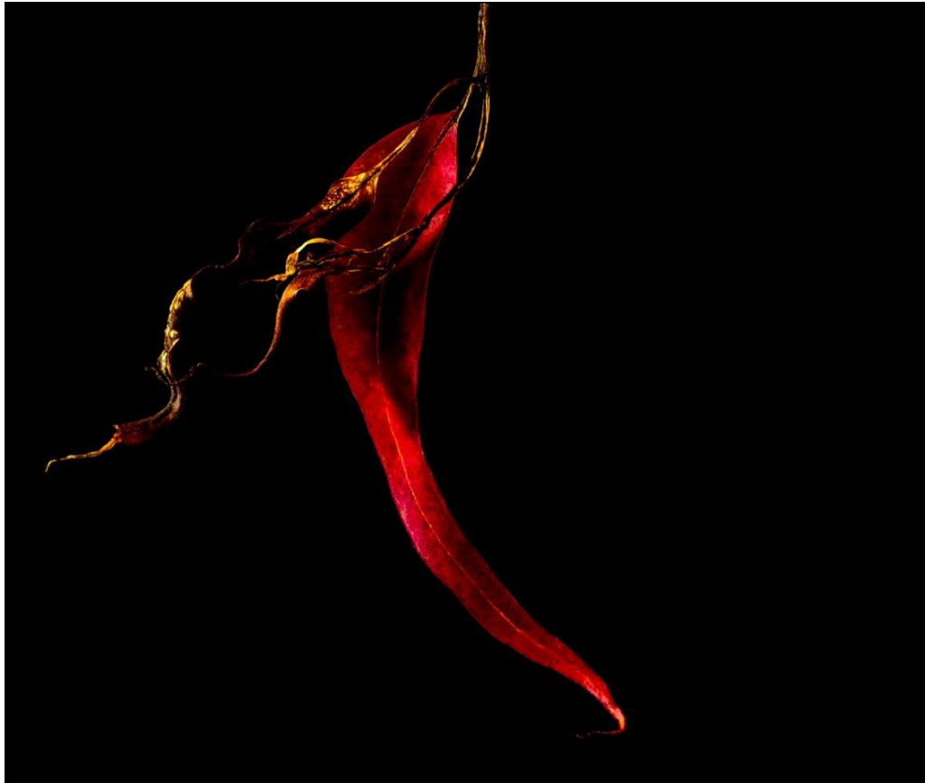
Remains of summer – Pam Brighton