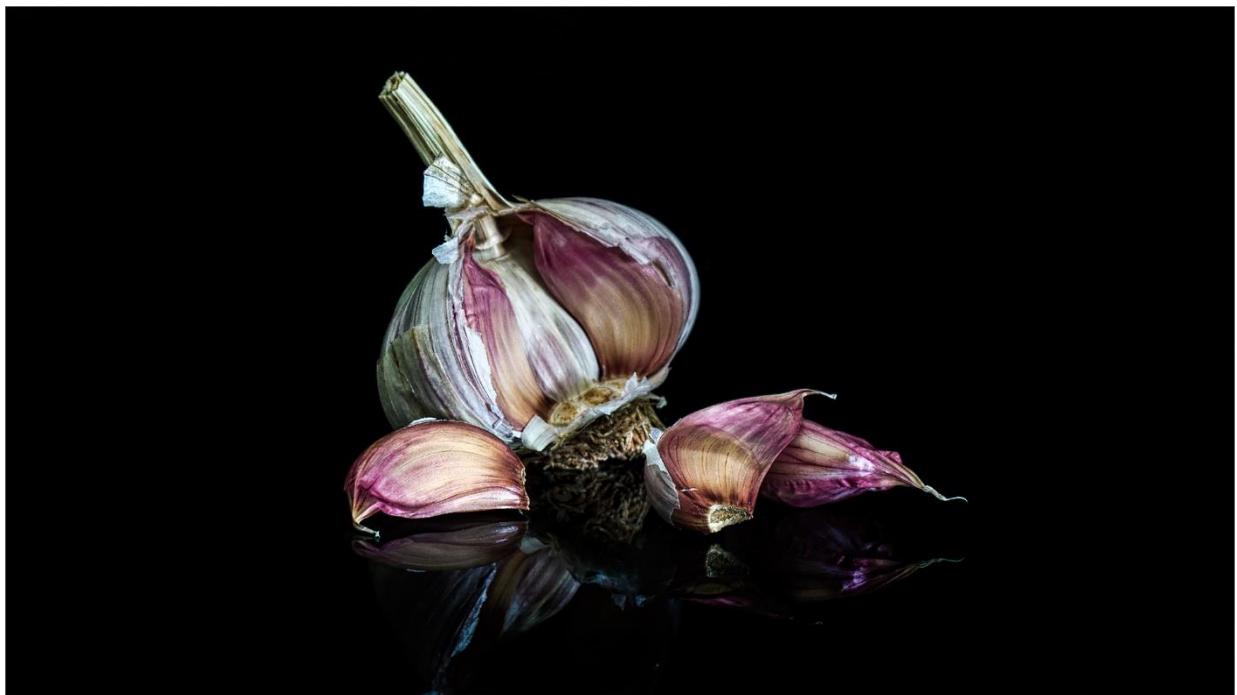
Garlic cloves