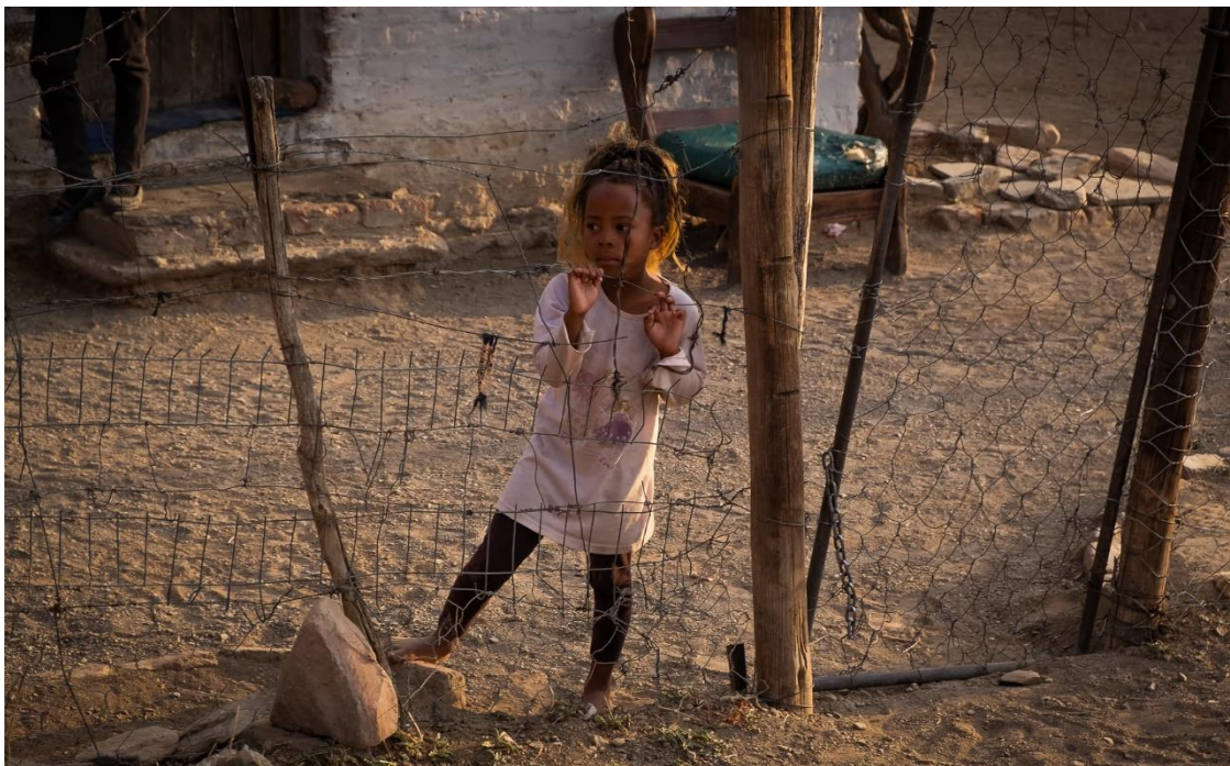
Fenced in -