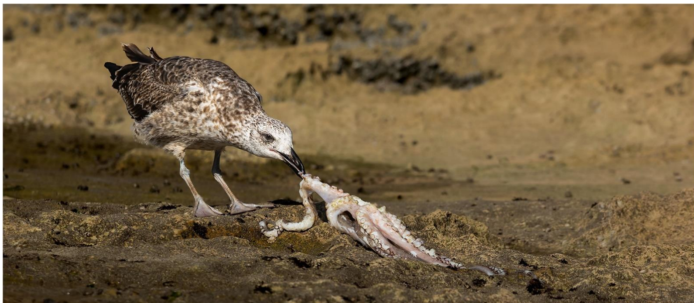
Young Gull having an oct snack- Andre Venter