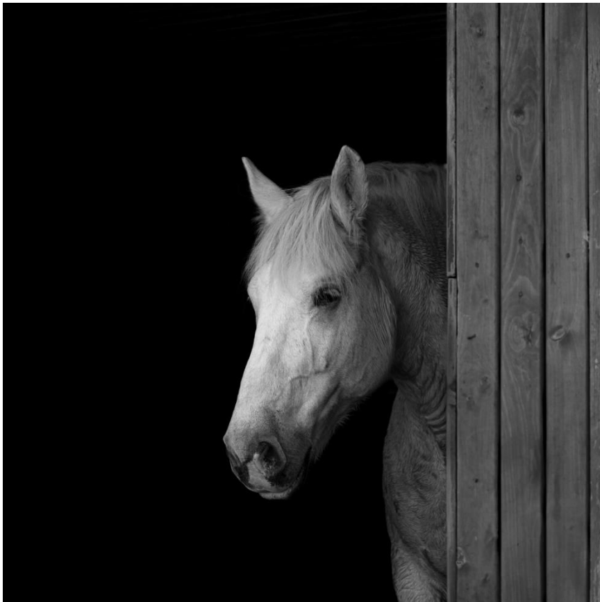
Monochrome Horse – Terence Clarke