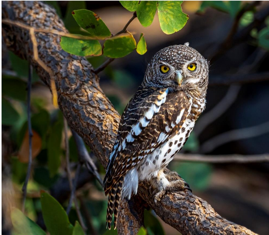
Pearl Spotted Owlet – Willem de Voogt