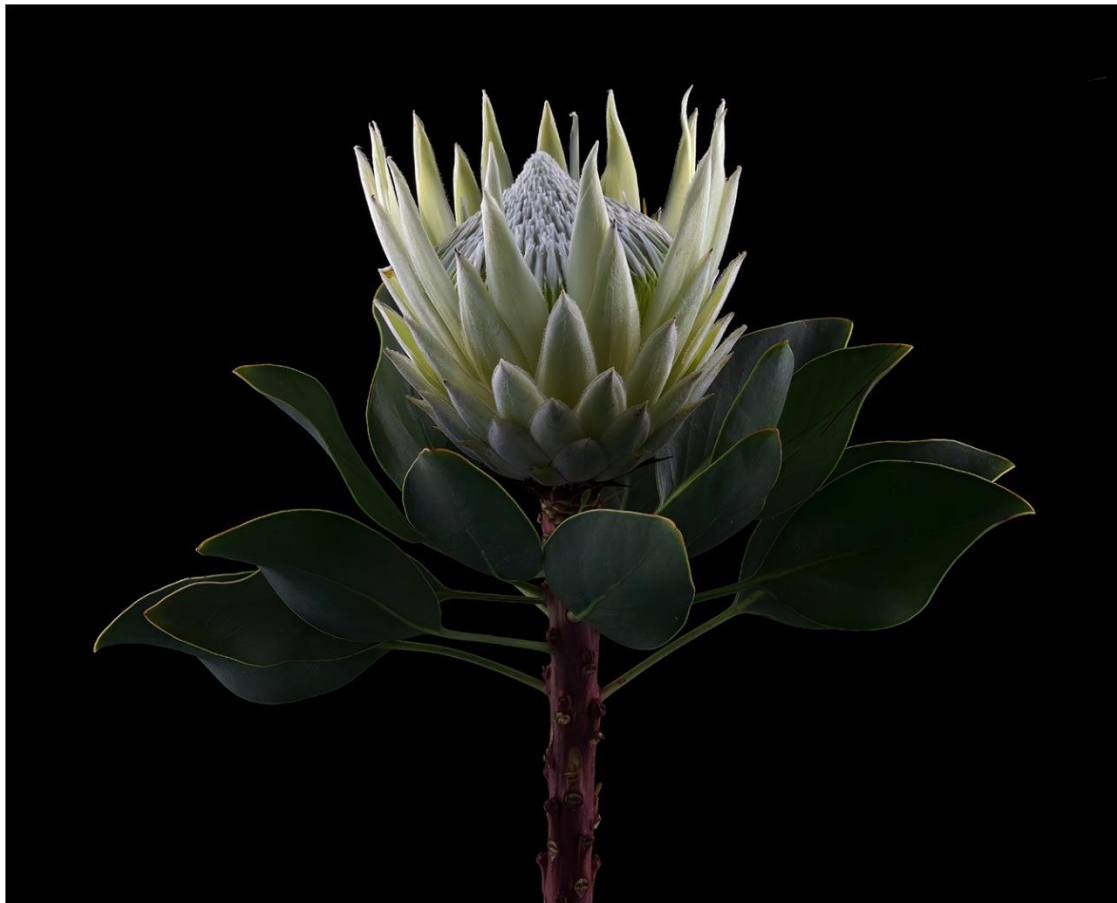
The King Des Kleiniebst